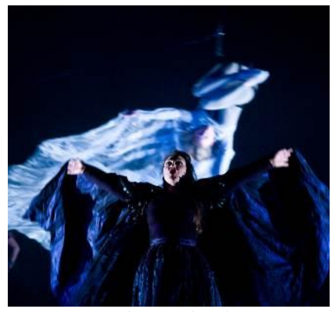
Māui - Photo: Stephen A'Court

with startling authenticity – whether as amorphous, floating beings or as twirling, spread-eagled shapes, suspended upside-down, by one leg. The draining of life-forces by the inhabitants of the underworld, can be symbolically illustrated through a slow and tortuous rising from the depths of dark places into the brightness of light; hovering in the atmospheric heights in a dream-like temporal place.