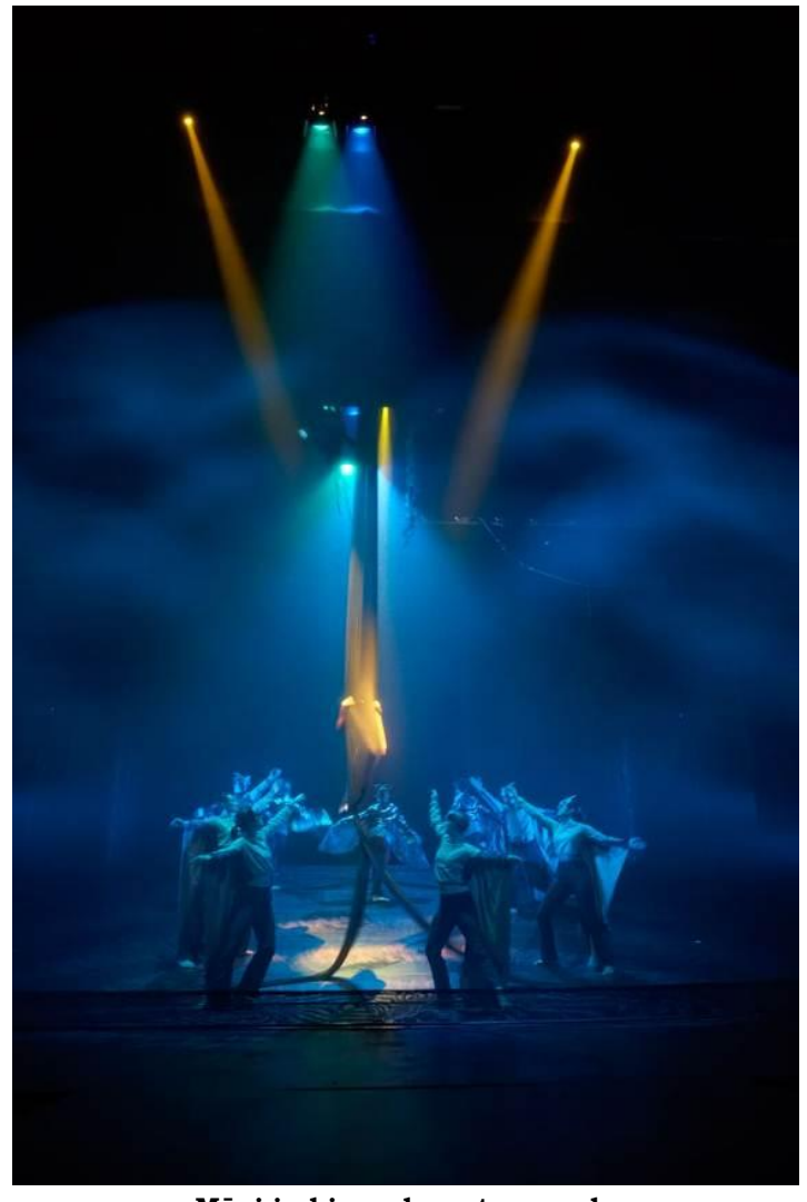
Māui in his underwater womb.