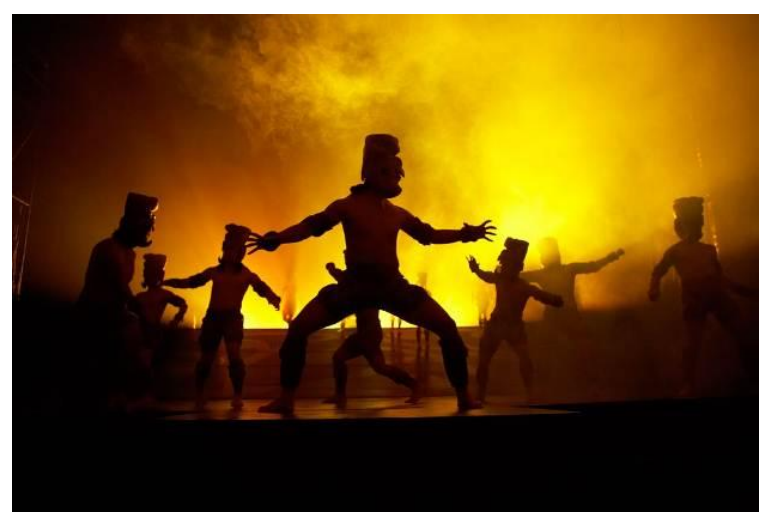
Te Ao Marama – The world's first dawn: Photographer: Diederik van Heyningen, Lightworkx Photography

Finally, the telling of a parental love story for a wayward child who cannot be controlled provided a rich emotional tapestry for us to mine the challenges and heartache that parents feel raising and preparing their children for the big wide world.