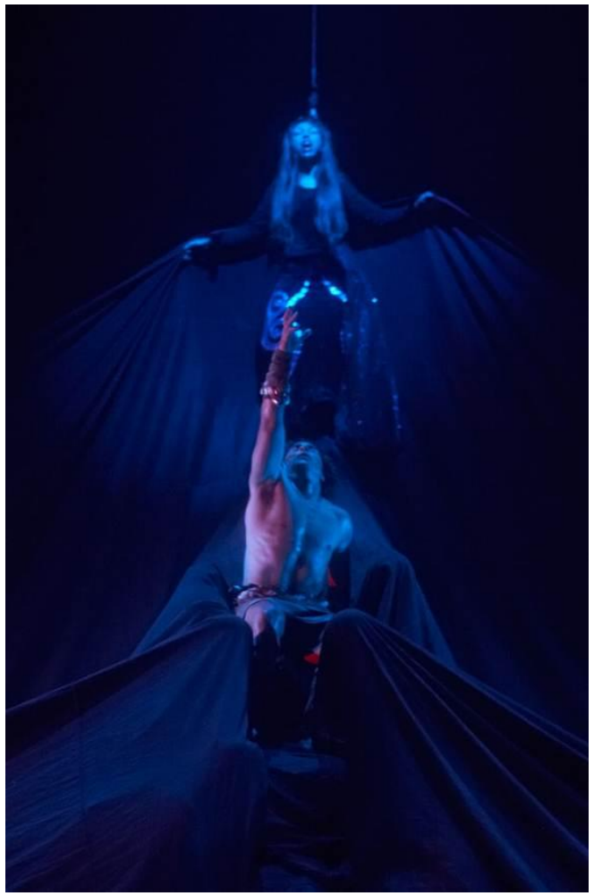
The death of Māui within Hine-Nui-Te-Po's embrace.