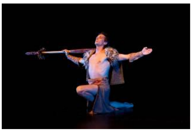
Tanemahuta Gray