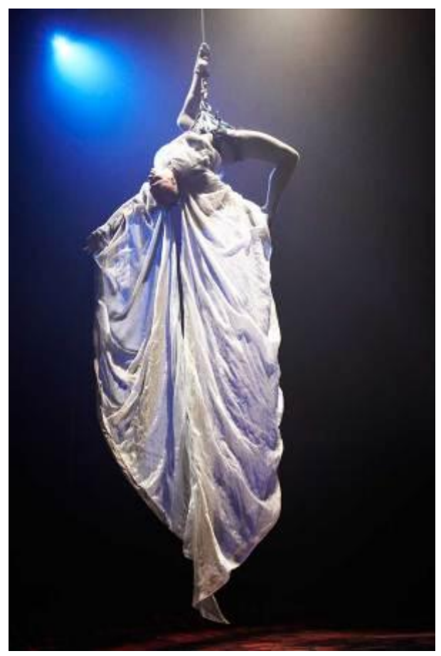
Māui – Ngā hau e whā – One of the Four Winds

Aerial dance can perhaps be broadly defined as imageryin-motion; a form that expands the parameters of dance into a spatial zone where anything is possible and where the shapes or images created are not limited to the capabilities of the individual dancer. The air of the performance space becomes the canvas, the dancer the brush with which to create the forms or illusionary effects.