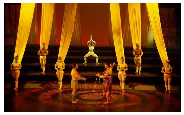
Māui training with Rā in the sun realm.