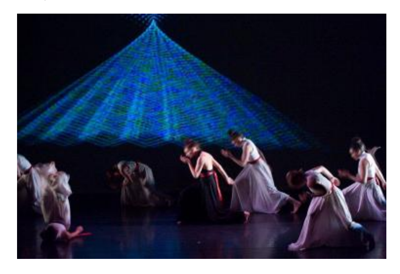
Black Rain- The Merenia Gray Dance Theatre

But Koowhiti , for those who attended will always mean the performance or a set of dance performances at Te Papa Tongarewa during Te Matariki. Some of these were excerpts from earlier shows and others were new shows. There were strong similarities amongst the shows and there were differences as well. Koowhit i then was a set of shows shifting in shape like dancing water in a fountain (cf Ka'ai Mahuta 2009).