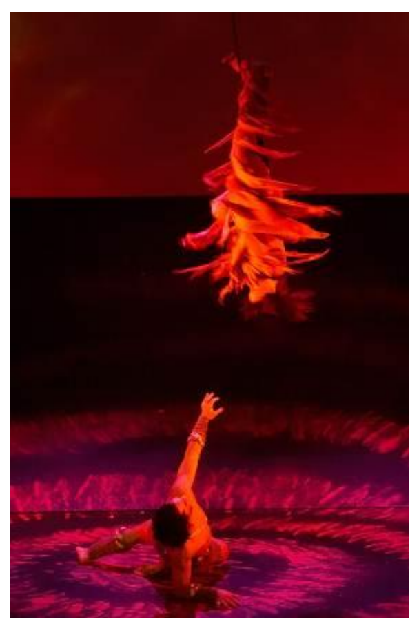
Māui - Fire Princess in Mahuika's lair