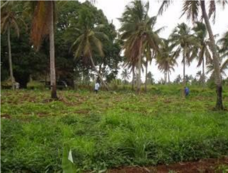
Local farmers at Vaini in Tonga's central district subsistence cropping on a small bush allotment to supplement their household income and food supply.

Semi commented that Melino's ability to think outside the box by steering away from old development habits where the state not small business owners control the economy, specifically for trade, is the reason the government bureaucracy does not engage his ideas on accelerating agricultural exports from Tonga to the New Zealand market.