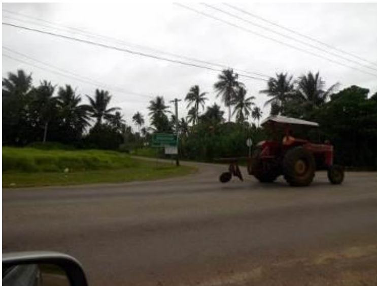
A local farmer at Vaini in Tonga's central district holds up motorists on the main road travelling from one bush allotment to another.

Helu recounted that attempts to advance Tonga by bringing it up-to-date and in line with Western democracies had flopped at fathoming how tradition, the authority of the monarchy and nobility, would be excluded from the development equation. Removing traditional power was not the desired option among the majority of people in Tonga as well as those living in New Zealand, Australia, and America. There had to be a Tongan way of doing development in the 21st century. And paradoxically, it would have to recognise Tonga's 19th century origins of modern state and society, a hierarchical system of social organisation and political life where the monarch was constitutionally the head of state and the nobility were represented in a Westminster model of parliamentary democracy.