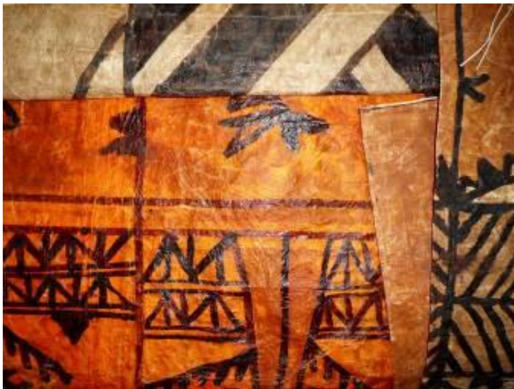
Tongan ngatu (bark cloth) used as a form of traditional wealth with kupesi (patterns) unique to Tongan art.