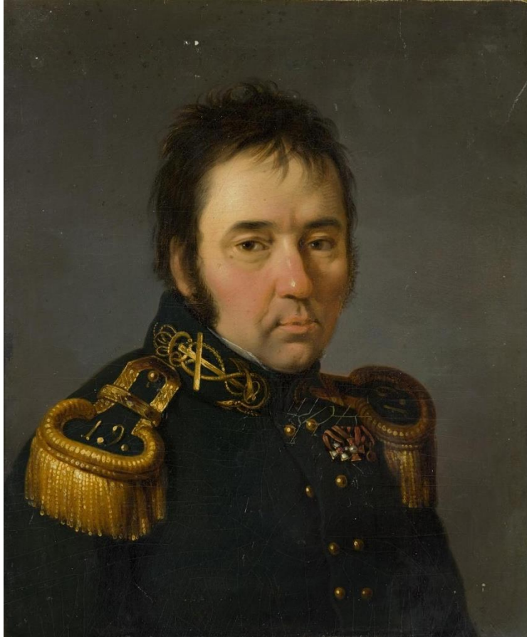
Fig. 3. Vasily Golovnin; portrait by Orest Kiprensky (c.1816), Hermitage Museum, Saint Petersburg.