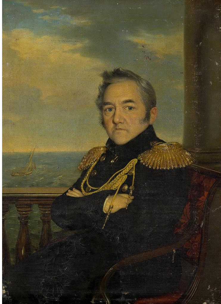
Fig. 6. Admiral M.P. Lazarev; portrait by R.G. Schwede (mid 1840s), Hermitage Museum, Saint Petersburg.

and Hawaii. The Russian-American Company, a Russian state-sponsored chartered company established in 1799 by Tsar Paul I, held a trade monopoly in the North Pacific. Seeking to broaden its economic influence, the company explored the Southern Ocean during this venture.