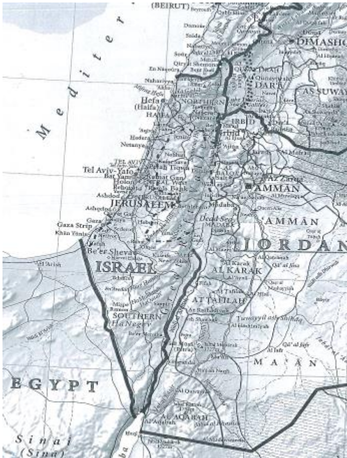
Israel/Palestine Te whenua o nga iharaira/Palestine