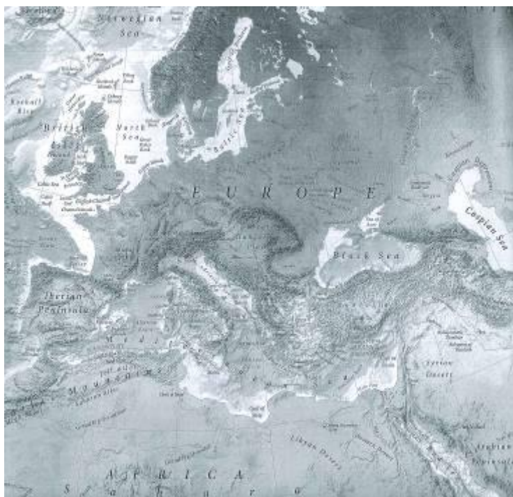
A map of England, Europe and Israel Ingarangi, Uropi me Israel/Palestine Time World Atlas