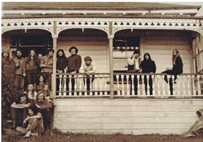
Kei te noho au i te paepae tuatahi ki te taha maau. I am sitting on the left on the first step.

Out of a number of possible starting points the group photo at my house on the Bombay hills in 1972 may be a good place to start. This house was just across the road from St Stephen's School, something of a contrast as the photographs show. The photo of me and my friends on the bougainvillia draped verandah of the old house I rented from the Main family where I had built an outdoor theatre and set up a workshop-studio was a very different place to the strict, dour even, face of St Stephens School.