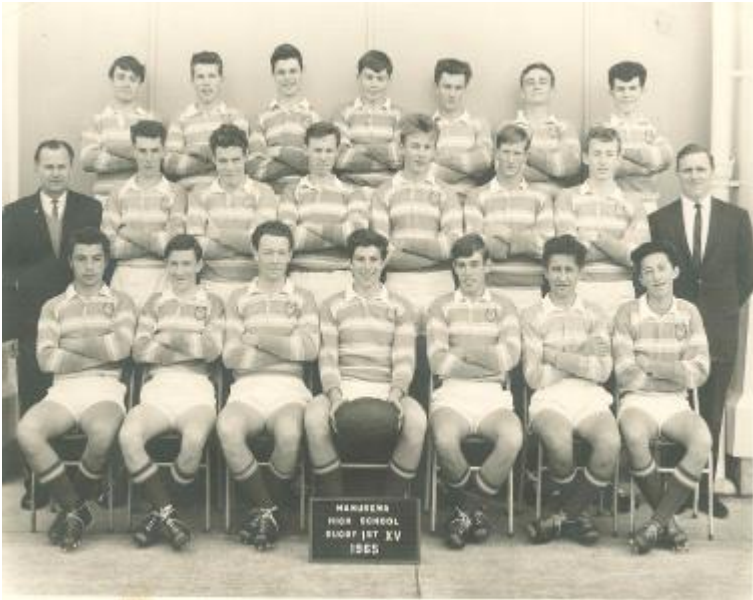
Te kapa hutupooro o te kura tuarua o Manurewa. Ko au te Tumuaki, The Manurewa High School First Fifteen. I am the Captain.