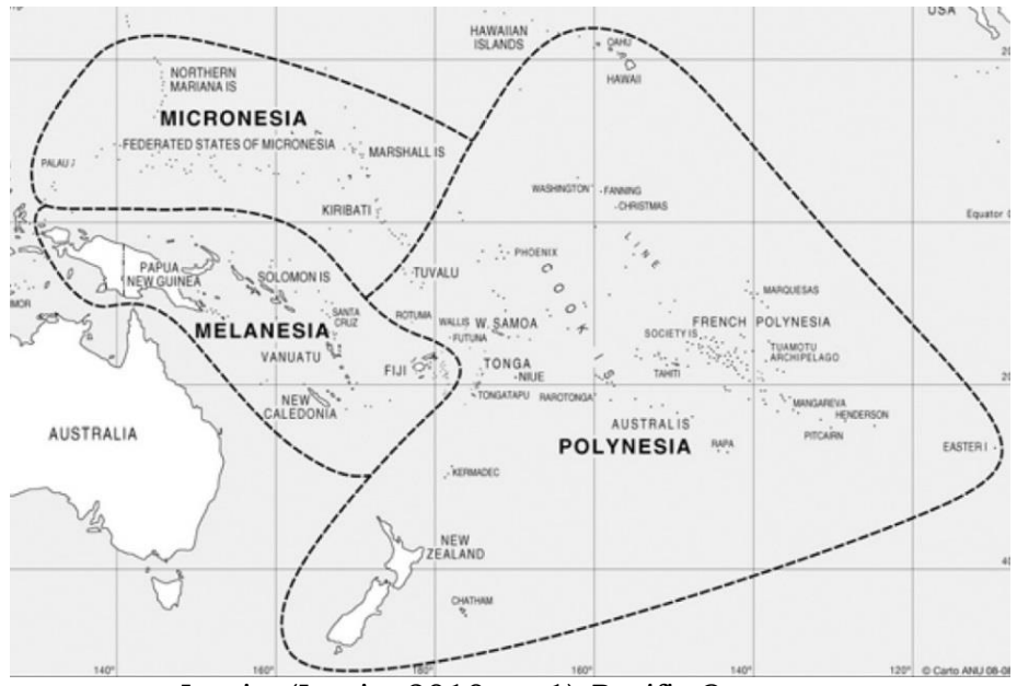
Lewis. (Lewis, 2010, p. 1) Pacific Ocean,

The Pacific diaspora is thousands of years old. For a very long time, people have been moving around the Pacific Ocean. In modern times, analysts have divided the Pacific Ocean into three groups of islands and peoples. Melanesia is the name given to a wide-ranging band of islands, many of them densely populated, extending from