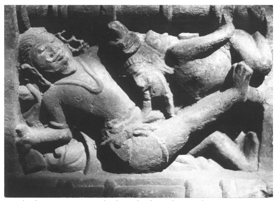
Figure 1: Lakshmana Temple in Khajuraho, 954 CE—a man receives fellatio from a seated male as part of an orgiastic scene (Kumar, 2019, p. 134).

Kidwai, 2000). Indeed, Vanita and Kidwai's (2000) book, Same-sex love in India: Readings from the literature and history, details in more than 300 pages many examples of same-sex love and homoerotic behaviour discovered in ancient Indian texts. While most examples are described in positive or neutral ways, some are described in negative ways: one example being that homosexual sex could result in being sent a particular hell where one would need to survive by ingesting semen (Vanita & Kidwai, 2000). Significantly, about Vanita and Kidwai's (2000) work, Rishi (2009) opines that "the book has the potential of being the manifesto of the gay and lesbian rights activities as it provides empirical evidence about the celebration of same-sex love across India over the last two millennia" (p. 201).