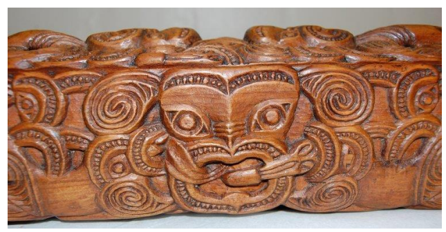
Figure 2: Mid to late 18th-century feather box or treasure box (papahou) made of wood, Haliotis shell (British Museum, Oc1964,05.1.a). Note: In this image, it appears that the central figure receives into its mouth a phallus, while at the same time a tongue emerges from the same mouth to make contact with a vulva.

As a Christian—I have experimented with several denominations. I have experienced the torment of coming to terms with my sexuality in light of some common (mis)understandings of Christian theology. In justifying Christian-based claims that homosexuality is wrong. sections of the New Testament are used which are based on interpretations of the Greek word, ἀρσενοκοῖται (arsenokoitai). This term is made up of two words: arseno-male; and koitai-a word that refers to a bed or bedroom and specifically to having sex with someone (Helminiak, 2000). More accurately, Helminiak (2000) argues, koitai refers to the active partner, or in other words, the penetrator. Boswell (1980, 1994), who argues Christianity was essentially indifferent homosexuality up until the late Twelfth Century, proposes that the word arsenokoitai refers to male prostitutes who were available for sex with either men or women. Countryman (1988) also maintains that arsenokoitai refers to male prostitution but more precisely to those male prostitutes who targeted older men to gain an inheritance. Helminiak (2000) contends that if the word arsenokoitai does, in fact, refer to male prostitution, that the problem lies not in the act of having