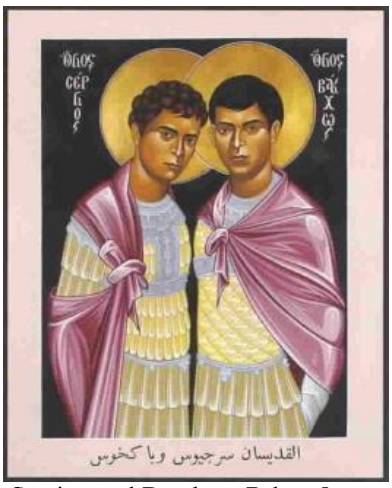
Figure 3: Saints Sergius and Bacchus, Robert Lentz, 1994 (Aburrow, 2009, n.p.)

sex - with either the same or the opposite sex - but with a particular type of prostitution that has "...something to do with sexual foul play around money" (p. 110). Scrogg (1983) agrees that arsenokoitai refers to prostitution but limits the definition to sex between males, and in particular, pederasty.