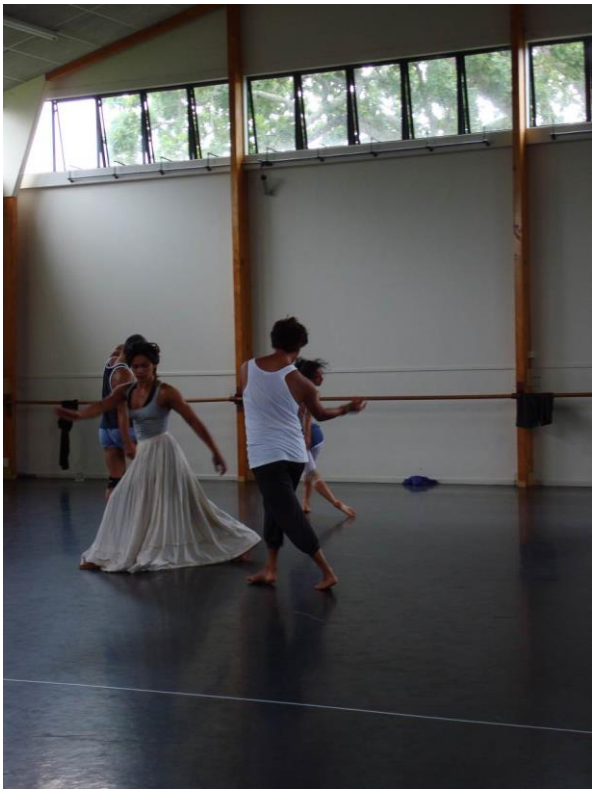
Atamira Dance Company rehearsal at Unitec, February 2009