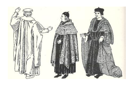
(Franklyn, 1970, p. 132)

Their dress, as with other clerical garb, had its origins in lay fashion; in time, however, the robe and hood came to distinguish scholars, both layman and cleric - modern academic dress was to evolve out of this context (Cox, 2001; Franklyn, 1970; Hargreaves-Mawdsley, 1963; Shaw, 1966). Despite the political and religious turmoil in continental Europe from the sixteenth to the eighteenth centuries resulting in the rejection of academic dress, the United Kingdom maintained academic attire in their universities as "...emblems of political orthodoxy" (Cox, 2001, p. 15).