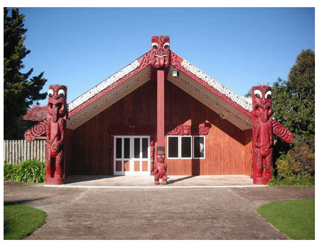
(Te Awamutu College, 2019, n.p.)