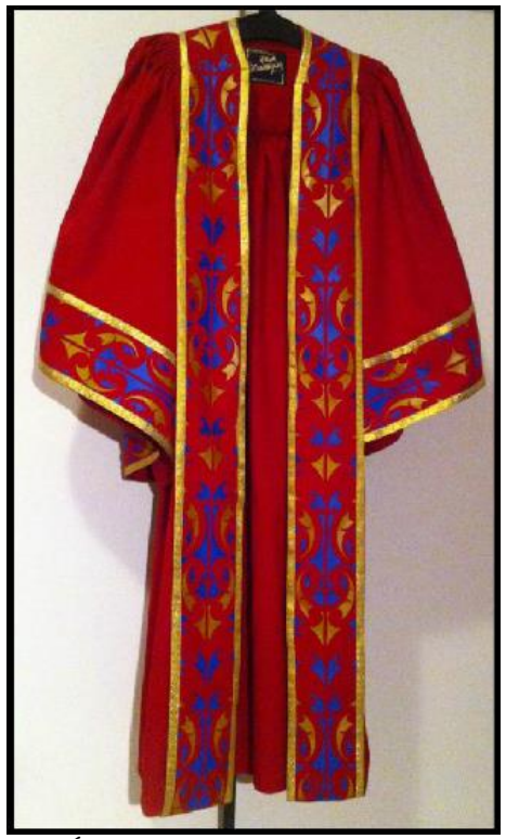
(Étude Classique, n.d.[b], n.p.)