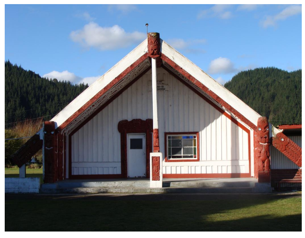
Tama-ki-Hikurangi wharenui, Patuheuheu marae, 2010, Waiōhau

on the grassed area or marae \bar{a}tea^{33} in front of the wharenui and naughtily jumping on the mattresses inside.<sup>34</sup>