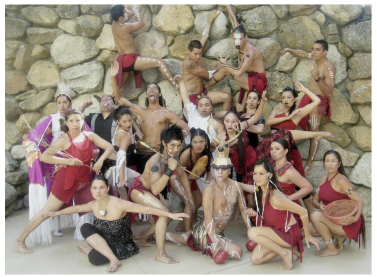
Pictured: Dancing Earth with Korou Productions and additional guest multi-disciplinary artists from First Nations of Mexico and Canada

So let me show you some images. [Shows image].