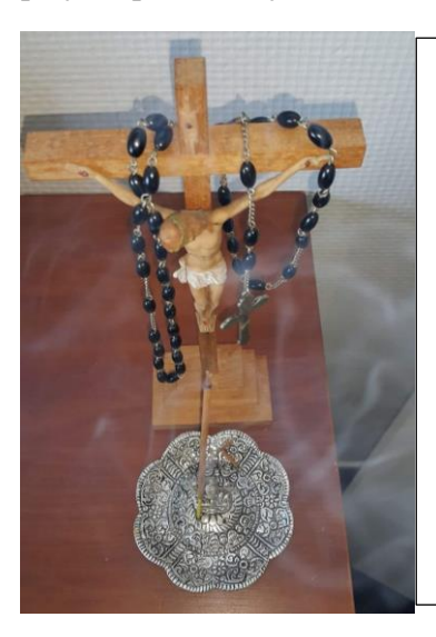
Image 3: Crucifix, Rosary beads, incense stick – a small prayer space in my bedroom, Grey Lynn, Auckland

My grandmother taught me that karakia day and night was essential to life. We pray in the morning to ensure that we have a good day; and we pray at night to protect our wairua from harm as we sleep. That's the prayer life.