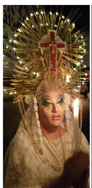
(B. Rangiwai, 2017, private collection)