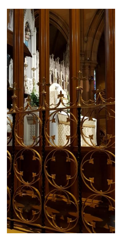
Image 5: Altar, tabernacle and reredos/retable, 1 St Mary's Cathedral, Sydney