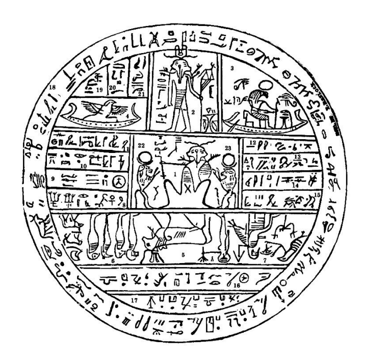
Image 2: A facsimile from the Book of Abraham, No. 2, Pearl of Great Price

The following are the translations or explanations, by Joseph Smith, found in the Book of Abraham, following the facsimile, which refer specifically to Kolob: