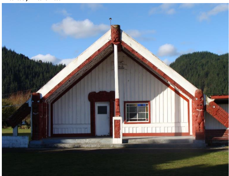
Image 6: Tama-ki-Hikurangi wharenui, 2010, Patuheuheu marae, Waiōhau