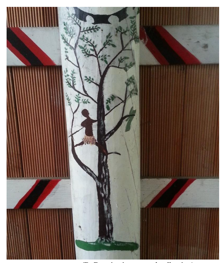
Image 7: Bird snaring scene on one of the heke inside Tama-ki-Hikurangi wharenui, Patuheuheu marae, Waiōhau