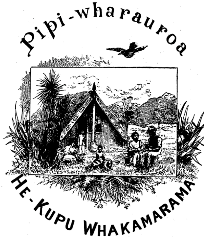
Figure 3. The masthead of the newspaper Te Pipiwharauoa – He Kupu Whakamarama .

Duval suggests that nearly all new items of vocabulary introduced into Māori during the nineteenth century were introduced and imposed by Pākehā because they controlled the printed word. 31 However, this suggestion is open to debate. As we have shown above, two of the four Māori-language newspapers he searched were owned and edited by Māori. While it is true that most of the Māori newspapers in the 1842-1862 period were edited by Māori-speaking Pākehā and were published by the government for colonising purposes, or were church and philanthropic papers, Māori-owned newspapers flourished from 1862. 32