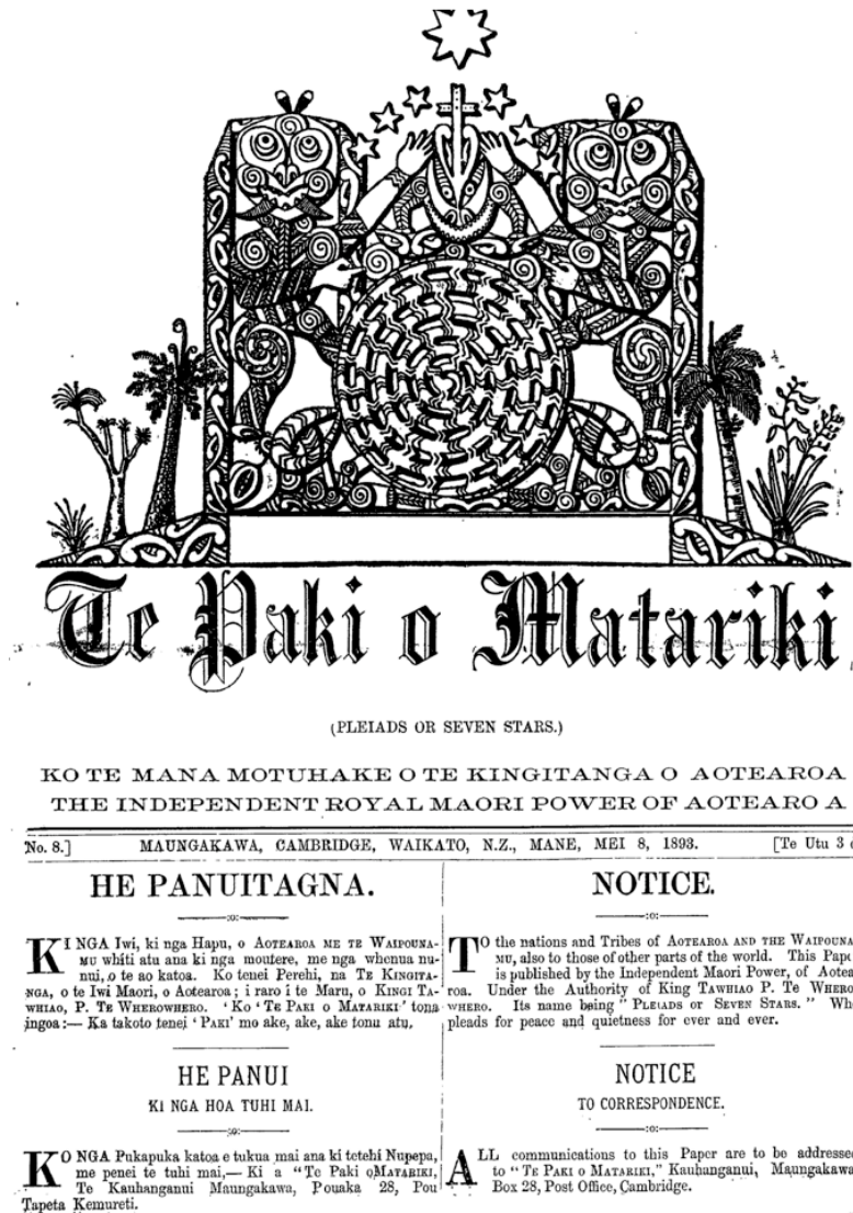
Figure 2. Part of the front page of Te Pahi o Matariki a Kīngitanga newsletter.

Te Taura Whiri i te Reo Māori has been the source and focus for the creation of new words since it was established in 1987. 28 These new words have been published as a dictionary of over 2,000 words, Te Matatiki Contemporary Māori Words . 29 While some loanwords from English that have become embedded in the language have been used in this dictionary, they are few. There has been a preference for creating new words in other ways. 30 New vocabulary created by Te Taura Whiri through the process of borrowing seems confined to foreign place names. This work has mainly been in response to requests from people using the language, particularly teachers of Māori language, writers of curriculum documents and resources, and translators.