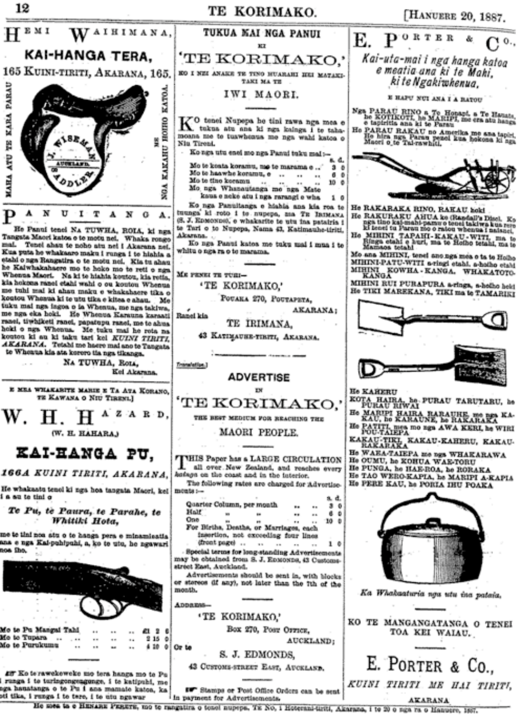
Figure 7. A page of advertisements from Te Korimako of January, 1887.

These examples of the addition of prefixes and suffixes and the use of kore further illustrate how the loanwords are not only adapted to the phonology of Māori, but are also integrated into the grammatical classes of bases so that they function in the same way as other bases that are not loanwords.