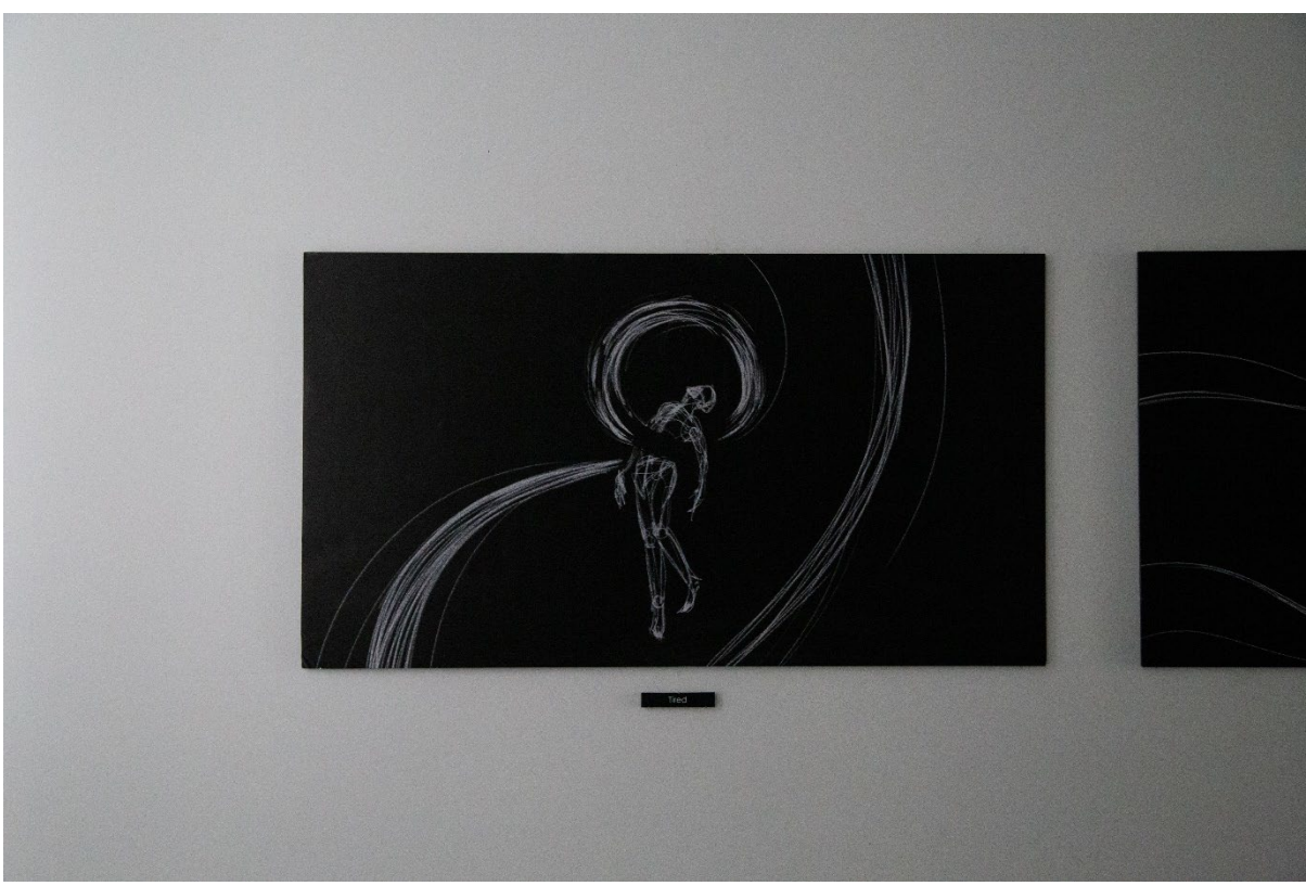
Figure 4. Emily Parr (photographer). Illustrations: Tired – Exhibition , 2022, photography, Auckland