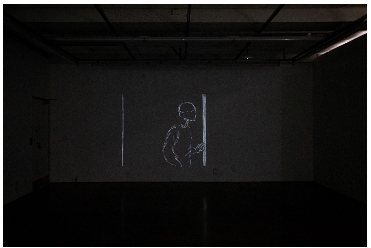
Figure 3. Shot: Enter - Exhibition, 2022, photography, Auckland

I remember pacing back and forth, wondering, "what do people think of my work?" and "what do they think of me?". I refused to walk into the space, almost afraid to interrupt the immersion for the audience. While I was extremely grateful for the celebratory support around me, I was deeply uncomfortable seeing my work. My contemplations on a large scale made me face those feelings again, but now in public. While animating the film, I was in the privacy of my home, with tears washing over my desk. At the exhibition, tears glazed over my eyes while I stubbornly refused their release.