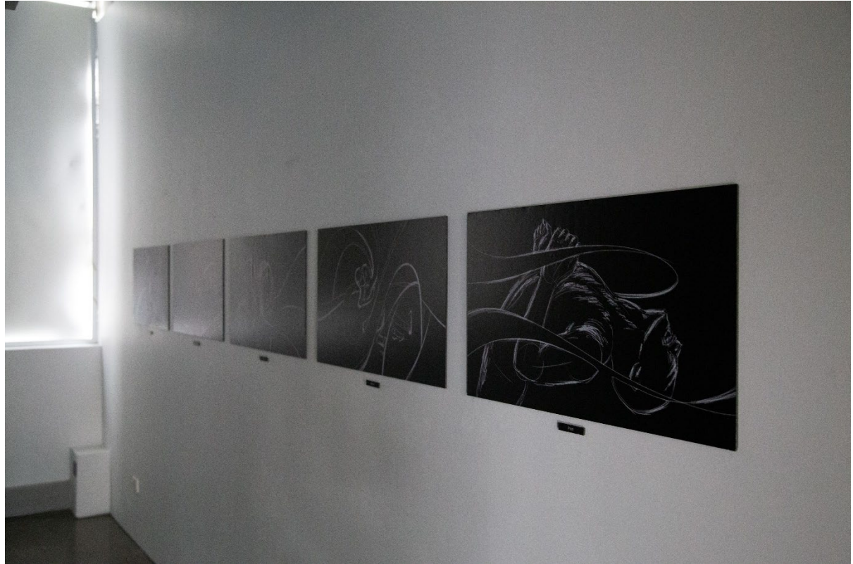
Figure 5. Emily Parr (photographer). Illustrations – Exhibition , 2022, photography, Auckland