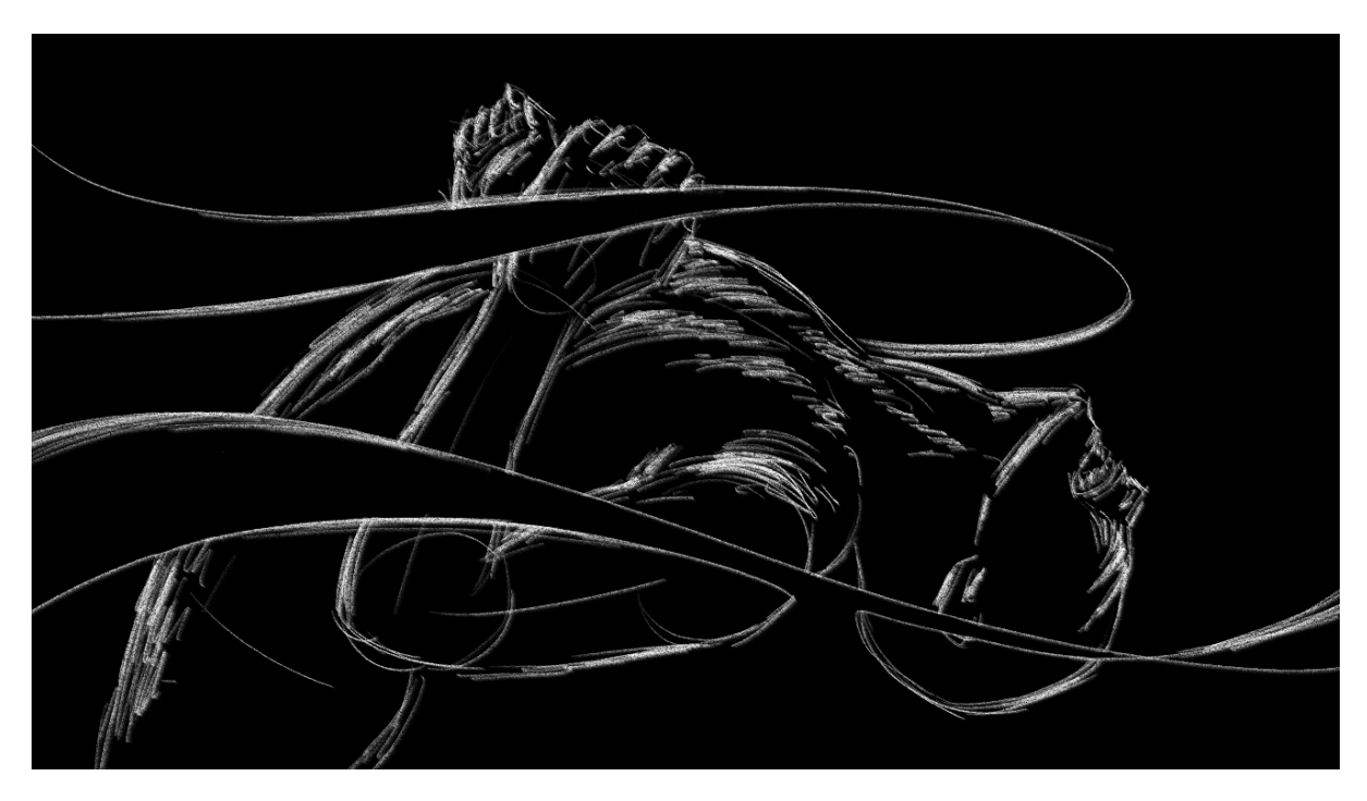
Figure 1. Lesley Ung. Iterative Drawing - Pain, 2021, digital illustration, Auckland

There was a reluctance to overshare, and I could not articulate or compartmentalise my ambivalent feelings to people around me. These observations ignited the exploration of my own anxieties and this personal discomfort around loss, using a medium that comforts me. However, in doing so, the personal contemplations created a daily ritual — to think, feel, and dream about death, loss and grief.