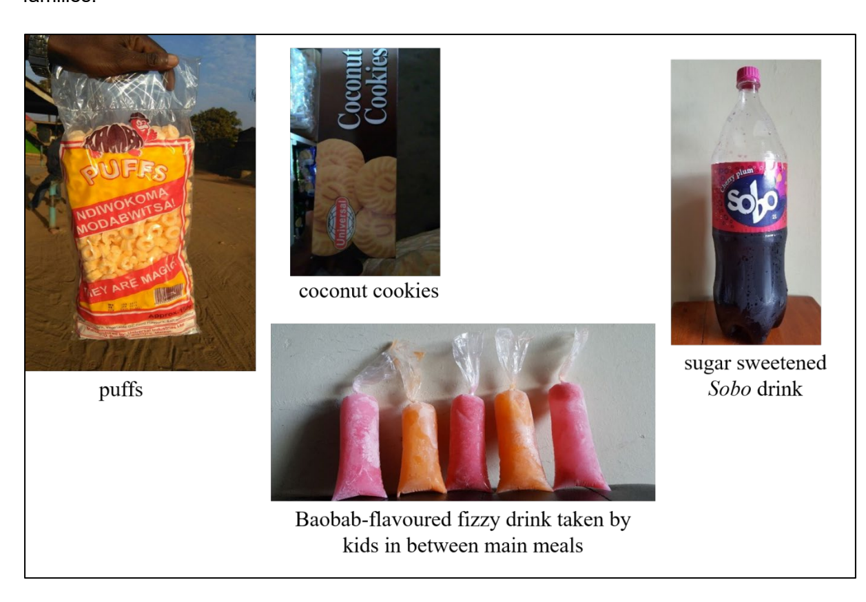
Figure 4. Snacks

A snack is any food taken between main meals or when a person feels hungry outside of the three main meals - breakfast, lunch, dinner. Figure 4 illustrates the snacks captured by the families.