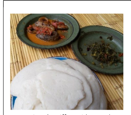
c. nsima (a stiff porridge made from maize flour), fish and green leafy vegetables for 3-4 family members

As with breakfast, carbohydrates - mostly nsima - constituted three quarters of the total lunch meal consumed; only two meals were comprised of rice and fried potato chips. Figure 2 illustrates the food that constituted lunch.