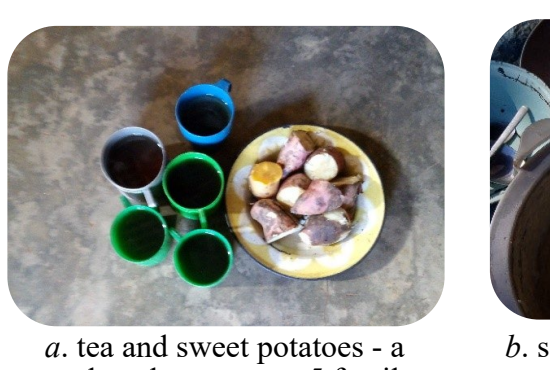
meal to share among 5 family members

Carbohydrates formed the bulk of the food consumed during breakfast. The most common energy sources ranged from simple, refined sugar and white bread to complex carbohydrates, such as sweet potatoes and soya porridge (see Figure 1).