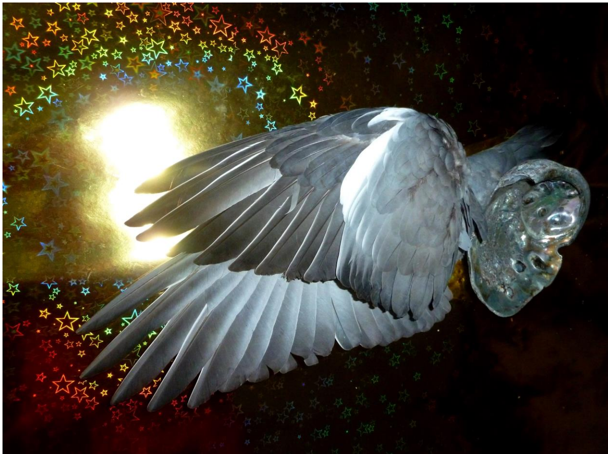
London: Peace on Earth (composition with pigeon-wing & abalone; photograph).