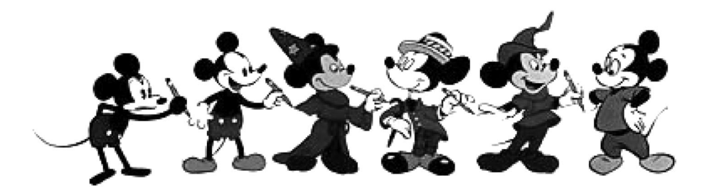
Figure 1. Mickey Mouse's body.