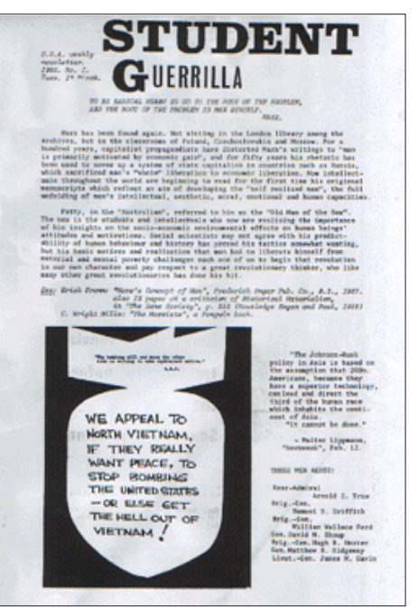
Figure 1: A Student Guerrilla front page.

This study examined 22 issues of Student Guerrilla , published between March 19 and October 16, 1968. Lead articles, their authors and themes were identified. Student Guerilla campaigned against the Queensland Traffic Act, which had been used against students distributing leaflets in support of a postal strike. It demanded a withdrawal of charges, an apology to the people of