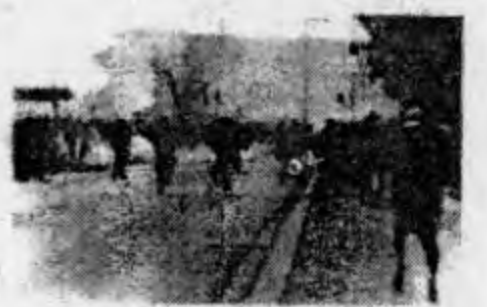
Protesting about their deaths

In recognition of the fallen students the University will establish a memorial garden area on the field where they die. Freedom of Expression, Clean Environment, Democracy and Peace