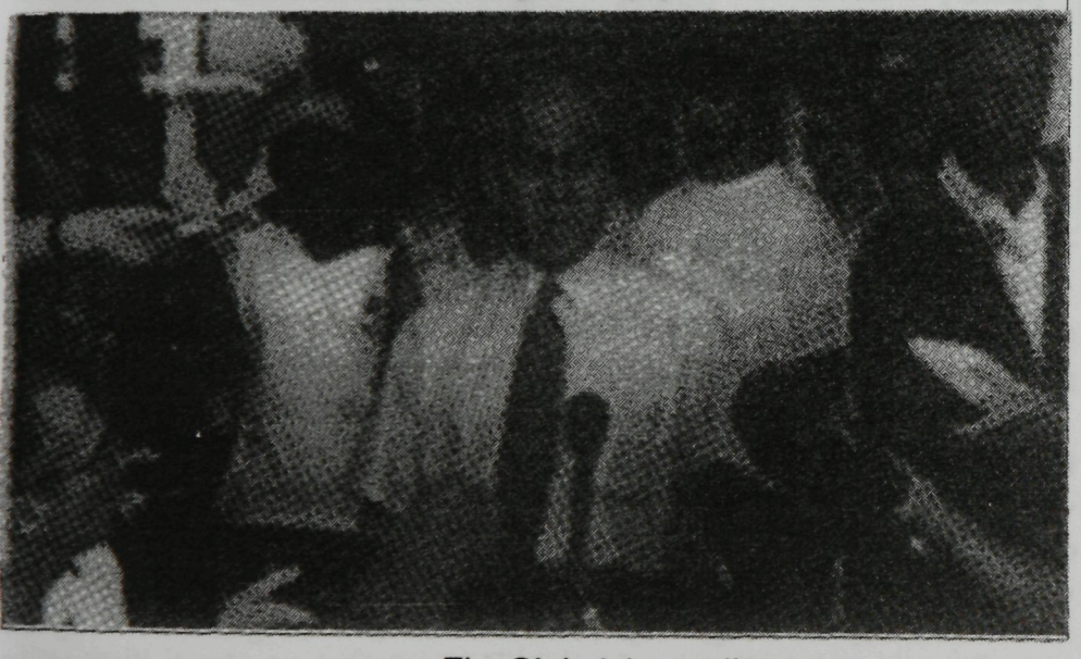
The Global Journalist reports on the Fiji coup coverage, August 2000.