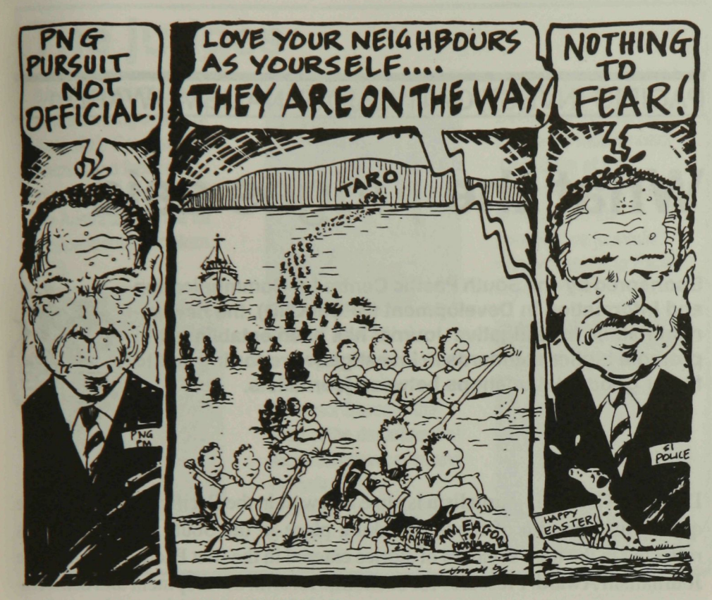
Solomons Voice, 4 April 1996: There was a mass exodus from the Choiseuls provincial town of Taro this week following warnings of PNG Defence Force incursions in what they claimed as 'hot pursuit' of BRA rebels. PNG Prime Minister Sir Julius Chan at the same time said such pursuit was 'not official' while Solomon Islands police said: 'There's nothing to fear.'