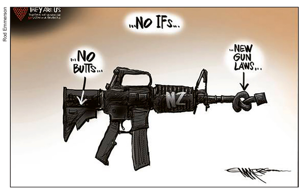
Figure 2: Rod Emmerson's take on New Zealand gun laws after the Christchurch mosque attack.

Rashna says she stood by while the 'fear and hate' continued to grow, until it became unbearable. 'I am done being a part of something I do not stand for, and I urge other young journalists to do the same.'