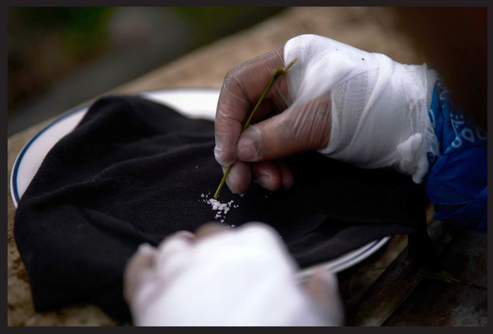
Figure 10. 'Aisi', a methamphetamine dealer in Tonga, showcases what he considers to be a high-grade form of methamphetamine that is popular in Tonga. Aisi claims that he can make TP$5000 selling meth to approximately 200 users on any given Sunday.