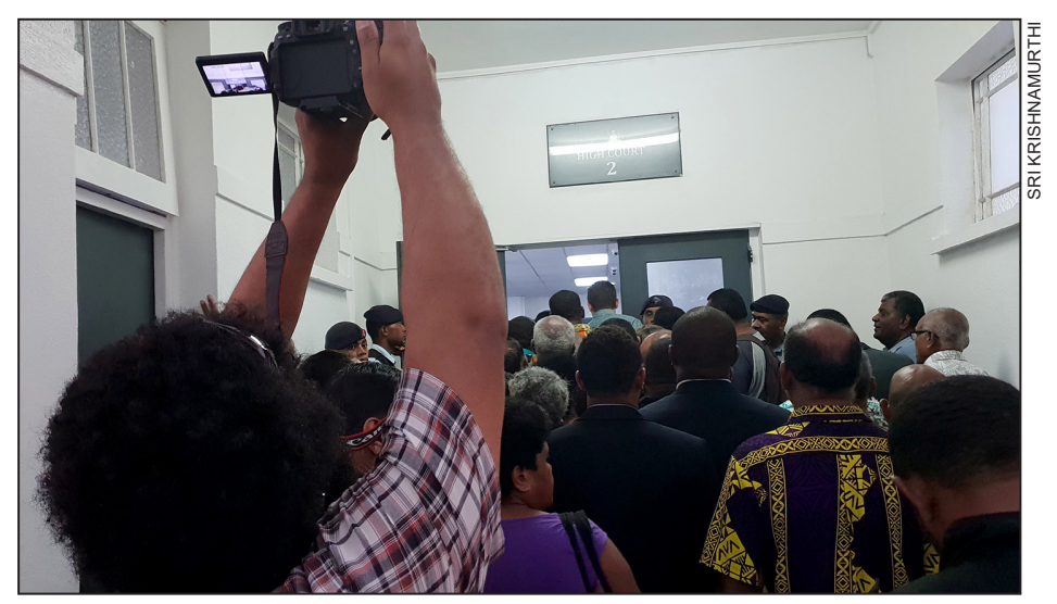
Figure 2: The scene outside the High Court in Suva for the FICAC appeal against the dismissal of electoral charges against Sitiveni Rabuka on 12 November 2018.

Among those, FijiFirst's third highest vote-recipient was Alipati Nagata, whose electoral number 668 closely resembled Bainimarama's number 688. Contrary to his subsequent protestations, he secured his seat largely due to erroneously completed ballots. (Fraenkel, 2019, p. 24)