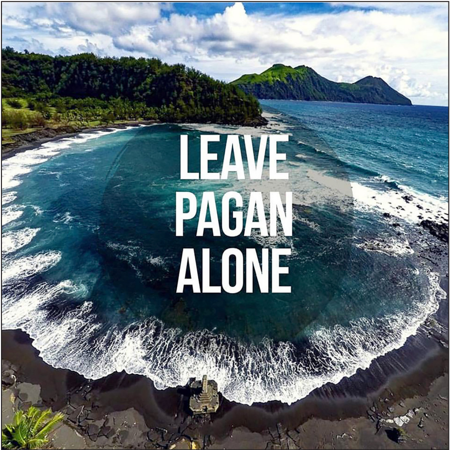
Figure 5: An aerial shot of Pagan, a beach the DoD intends to use as a Live-Fire Training Range from the land, sea, and air.

expense of climate change adaptation planning in the Marianas Archipelago. The US federal government and the DoD continue to treat the archipelago as ‘garrison islands’ (Camacho, 2013 p. 176). While the DoD acknowledges the threat and risks of climate change, it continues to invest billions of dollars into the construction of installations in high-risk zones and creates EIS documents which systematically violate the National Environmental Policy Act (Cabrera et al., 2015). While the Marianas community was told in 2016 to expect a Supplemental EIS to be released in ‘early 2017 and a ROD by 2018’, the website now reads, ‘late 2018 or early 2019’ (CNMI Joint Military Training EIS/OEIS, 2018).