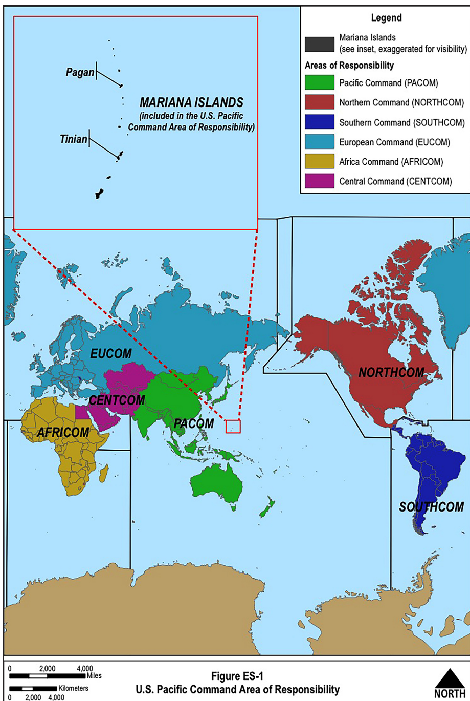
Figure 2: 'US Pacific Command Area of Responsibility', p. ES-2, 2015.