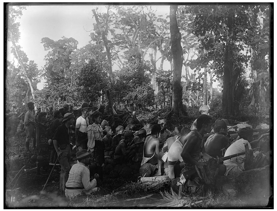
Figure 2: Samoan combatants ready for action.

Turkish bath and the perspiration would trickle down and try to spoil my plates' ( Otago Witness , 21 November 1900, p. 11.) The result of all this effort was often disappointing.