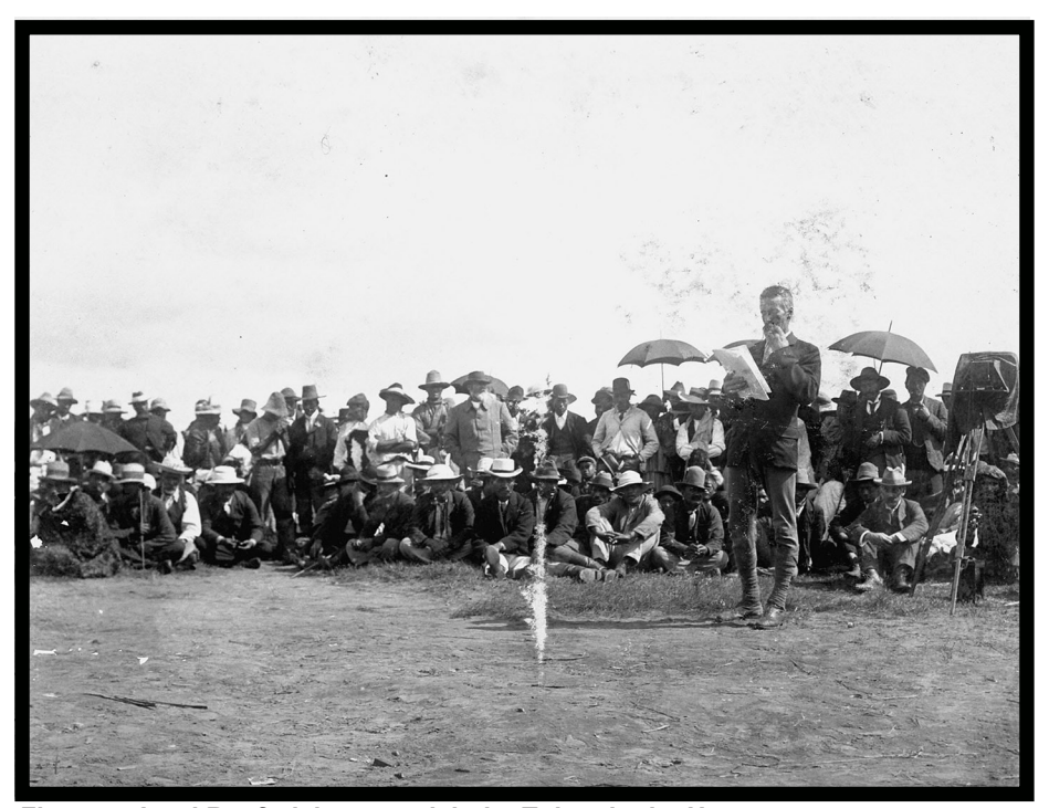
Figure 4: Lord Ranfurly's party visit the Tūhoe in the Ureweras.

Tūhoe people in the Ureweras in 1904. This was another arduous trip but Ross again took his camera (Figure 4) and had a very comprehensive photographic record of the trip. It should have been an opportunity to capture the character of the country and its people but again Ross's photography seems distant and detached.