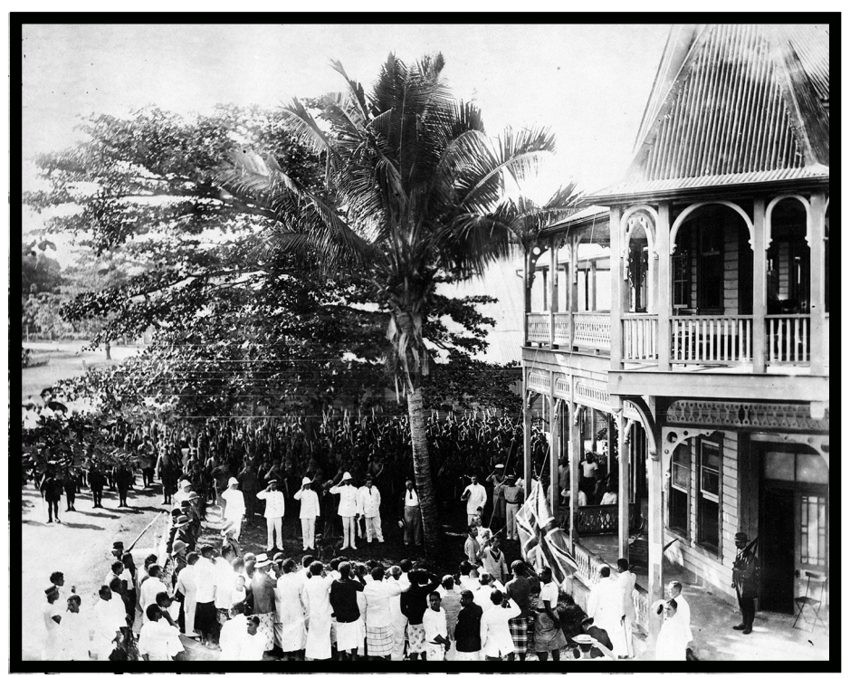
Figure 6: Hosting the Union Jack in Apia, Samoa, on 29 August 1914. Image by Alfred James Tattersall, courtesy of the National Library, Ref: PA1-q-107-32-1.

by Malcolm Ross. A photograph of the hoisting of the Union Jack in the capital Apia on the August 29 was by Alfred James Tattersall, a New Zealand photographer resident in Samoa at the time.