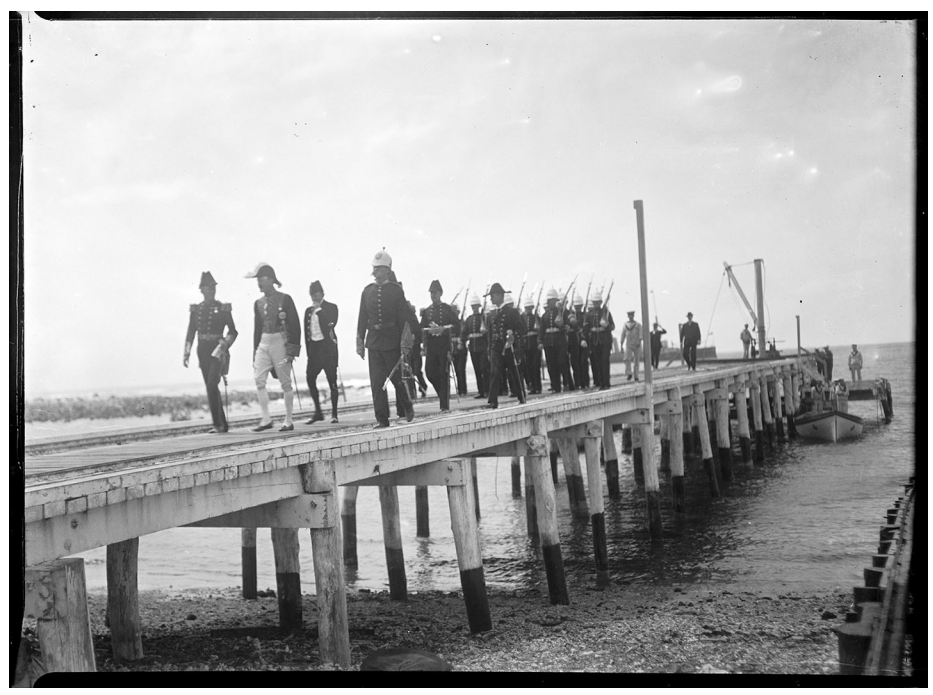
Figure 3: The arrival of Lord Ranfurly's party in Rarotonga, 1990.

Minister of Defence during the war. When Ross was appointed New Zealand's official war correspondent in 1915, the New Zealand Truth printed a poem by an anonymous fellow journalist: