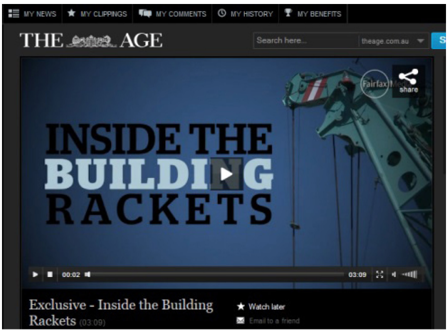
Figure 1: The Inside the Buildings Rackets multimedia series in The Age.

happened lately—there's been a spike of organised crime and especially bikie involvement in the building industry, often overlapping with the operations of the construction union—the CFMEU. So we've been looking at this for ten years. In the last year or so, we developed a number of very critical inside sources who've allowed us to follow a bit of a money trail and confirm and corroborate the fact that organised crime was thriving in the building industry in New South Wales and Victoria, and that bribes and inducements were being paid in rackets involving both union officials and building companies.