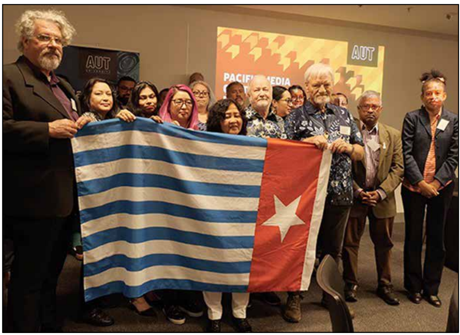
Figure 2: Multiethnic members of the Pacific Media Centre collective defiantly raise the West Papuan Morning Star flag, banned by Indonesian authorities, at a public seminar at Auckland University of Technology on 1 December 2020.

a cultural hub, where guests might receive a sung greeting from the staff, Pacific-style, or see fascinating artworks and craft.