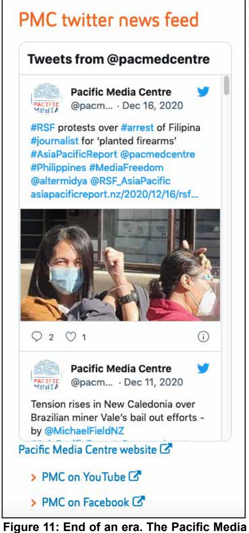
Figure 11: End of an era. The Pacific Media Centre made strong use of social media and this was its final tweet on 16 December 2020.

None of the original management team involved in establishing the centre in 2007 remained at the institution in 2020, and their neoliberal successors did not share the original