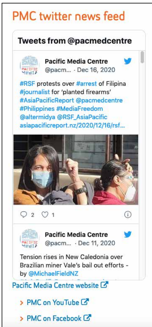
Figure 11: End of an era. The Pacific Media Centre made strong use of social media and this was its final tweet on 16 December 2020.