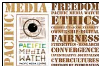
Figure 8: The PMW logo.