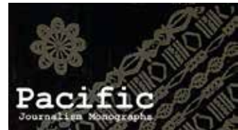
Figure 7: Pacific Monographs

One of the core projects at the Pacific Media Centre was the Pacific Journalism Review research journal, founded in 1994 at the University of Papua New Guinea. It was published for four years at UPNG and then relocated to the University of the South Pacific in Fiji, where it remained for a further four years before being published until 2020 by the PMC. It has now been adopted by a new incorporated non-profit, Asia Pacific Media Network ( https://ojs.aut.ac.nz/pacific-journalism-review/ ). Traditional with a moderately radical edge, the journal has maintained a strong reflexive journalism stance as a research publication. According to its website's declared ethos,