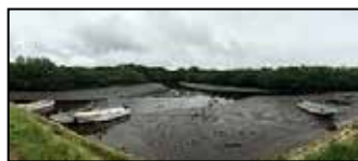
Figure 5: Daku Village

A three-year Pacific climate research storytelling documentary and journalism project contributed to a disruption and renewal theme in Pacific Islands countries’ development. The project was an offshoot of the Asia Pacific Internships but had a course structure and credits towards postgraduate degrees at AUT. It adopted the name ‘Bearing Witness’, drawing on the Quaker tradition of taking action over ‘truth’, based on conscience and being present