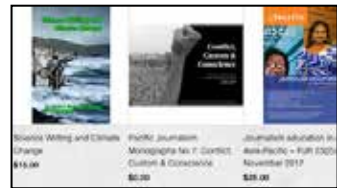
Figure 9: 10 books published

Project Link: Pacific Media Centre Books, 2020. https://www.autshop.ac.nz/pacific-media-centre/