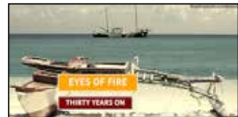
Fig 10: Eyes of Fire microsite