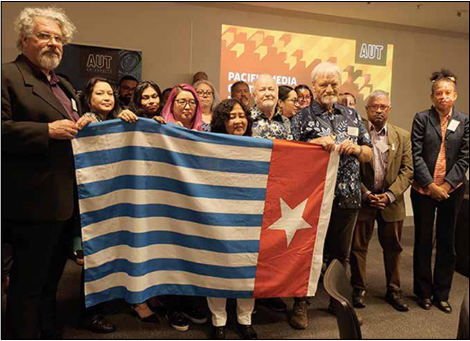
Figure 2: Multiethnic members of the Pacific Media Centre collectively defiantly raise the West Papuan Morning Star flag, banned by Indonesian authorities, at a public seminar at Auckland University of Technology on 1 December 2020.

a cultural hub, where guests might receive a sung greeting from the staff, Pacific-style, or see fascinating artworks and craft.