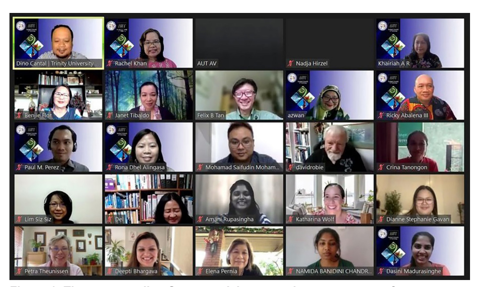
Figure 1: The COVID reality: Some participants at the ACMC2021 conference.

In place of a cultural show, which has a been a tradition for the host university of the ACMC conference, the virtual event featured a song that captured the sights and sounds of New Zealand. The song in Te Reo Māori by Maisey