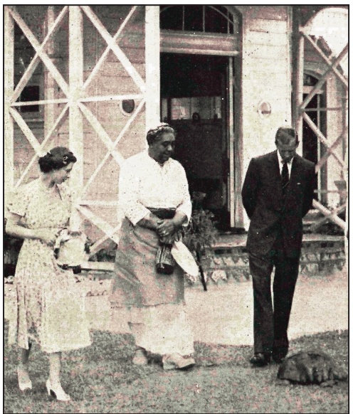
Figure 8: Queen Salote, Queen Elizabeth and the Duke of Edinburgh inspect Tui Malila, the tortoise said to have been presented by Captain Cook in 1777. The tortoise died in 1966.

Figure 9: Queen Salote farewells Queen Elizabeth as she prepares to board the royal barge that will take the royal party to the SS Gothic .