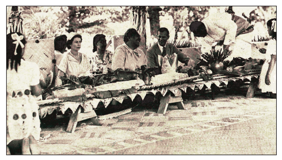
Figure 3: Queen Elizabeth and the Duke of Edinburgh share a banquet with their Tongan hosts. The visitors were waited on by members of the Nobility.