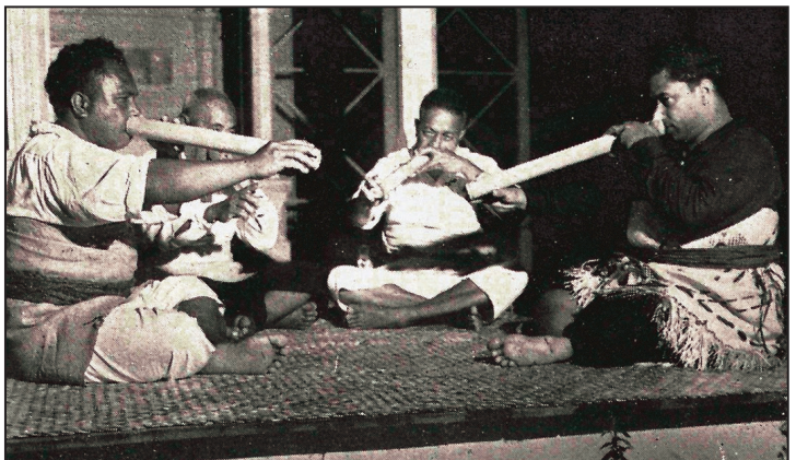
Figure 6: These Tongan musicians serenaded the visitors with wooden nose flutes on the Sunday morning of their visit. Later they attended a Wesleyan church service, which was attended by about 2000 people.