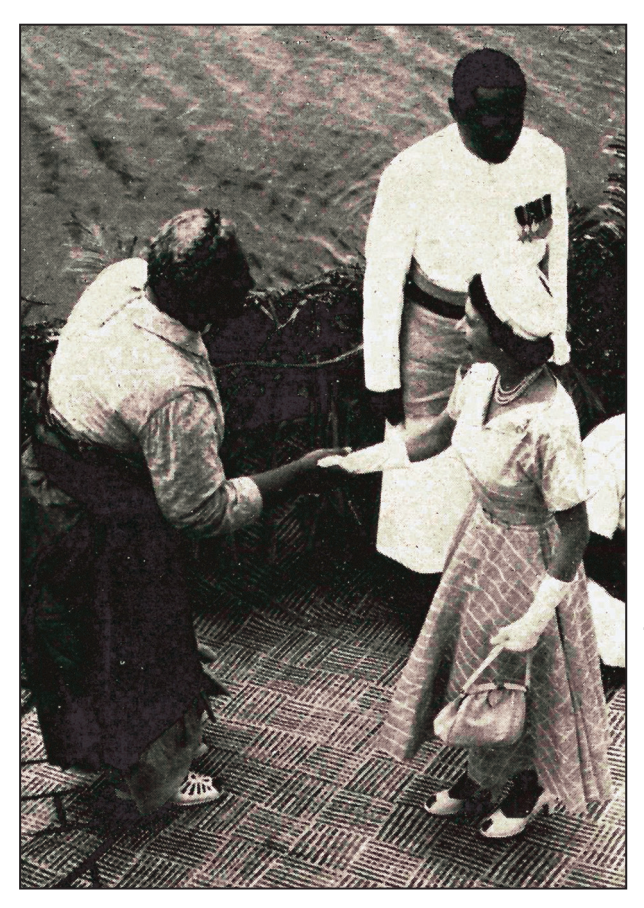
Figure 1: Her Majesty Queen Salote welcomes Her Majesty Queen Elizabeth to the Kingdom of Tonga at the start of the British monarch's 1953-54 visit.

These photographs are from the Royal Tour Picture Album's section of the Tongan visit. Because Queen Salote was such an imposing figure she dominates many of the photographs. It is also likely that she was featured so heavily because she was so well known in the UK from her visit to Queen Elizabeth's coronation.