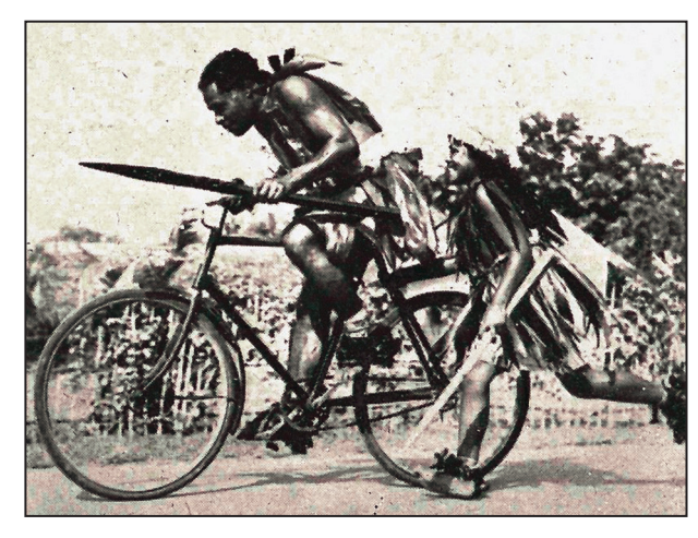
Figure 5: This member of the welcoming party which perfomed the Sipi Tau for the royal visitors caught the royal photographer's attention as he bicycled home with his daughter running beside him.