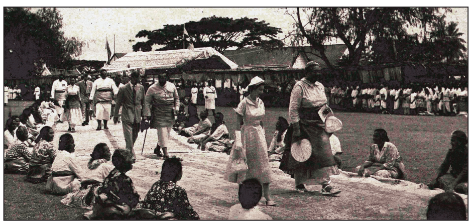
Figure 7: Queen Salote leads the royal procession to the mala'e where a banquet had been prepared. Crown Prince Tungi, who was also the Prime Minister, accompanied the Duke.