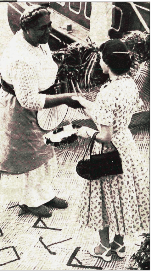
Figure 9: Queen Salote farewells Queen Elizabeth as she prepares to board the royal barge that will take the royal party to the SS Gothic .

PACIFIC JOURNALISM REVIEW 28 (1 & 2) 2022 263