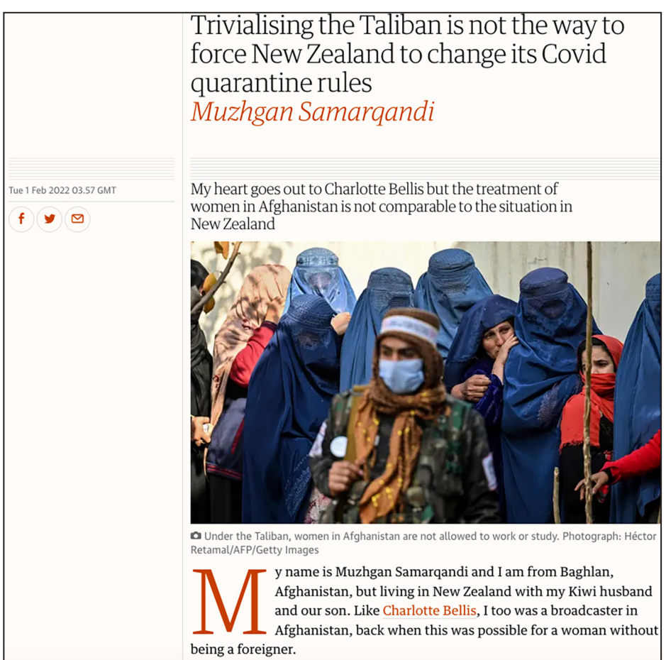
Figure 1: A Muzhgan Samarqandi opinion article featured in The Guardian on 1 February 2022.

criticism ( 1News Facebook, 2022), and the prevailing support for a particular narrative, that excludes minority voices like mine, and our perspectives. It points to a lack of diversity and representation in New Zealand media, and a resulting lack of balance and fairness.