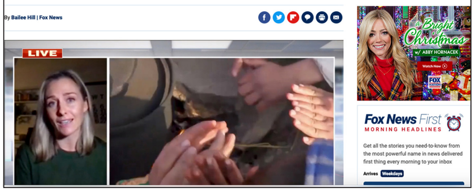
Figure 2: Headline on a report featuring New Zealand journalist Charlotte Bellis in an interview with Fox News presenter Bailee Hill.

Charlotte Bellis said 'emergency allocation' request to return to New Zealand was denied