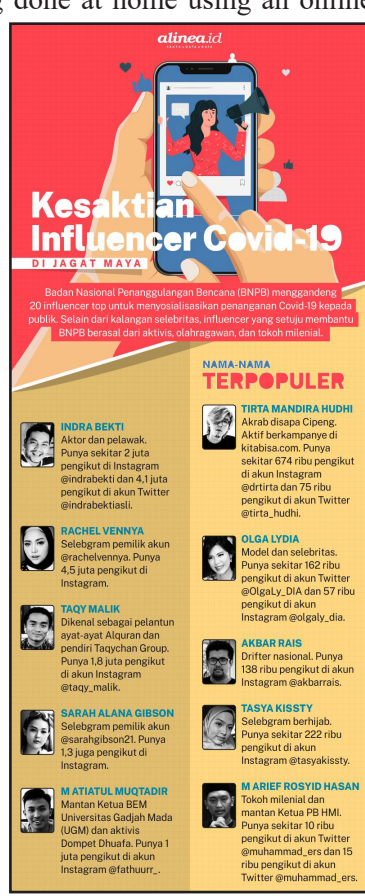
Figure 3: Influencers collaborating with BNPB

The list of influencers (Figure 3) that BNPB asked to strengthen the information dissemination process related to the COVID-19 outbreak have diverse backgrounds—activists, sportsmen, and millennial generation figures. From the graphic, each person's network can also understand the impact of amplifying the message conveyed by each influencer. In the context of the value of popularity and strong attachment to the audiences, these influencers' messages or