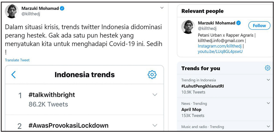
Figure 1: Marzuki Muhammad's tweet on Twitter trending topics

Information dissemination in the media, specifically the internet, which is one of the primary sources for information sought by the public related to the COVID-19 outbreak, has become increasingly relentless. The information presented has been related to accurate and reliable situation reports and false information in various forms, not only text-based but also audio and visual. The chaos of data, coupled with a central response that seemed unprepared, shaped the Indonesian community's perceptions of the COVID-19 outbreak. Even on online social media, there was a sad response from people on Twitter to the current conditions as illustrated in Figure 1: