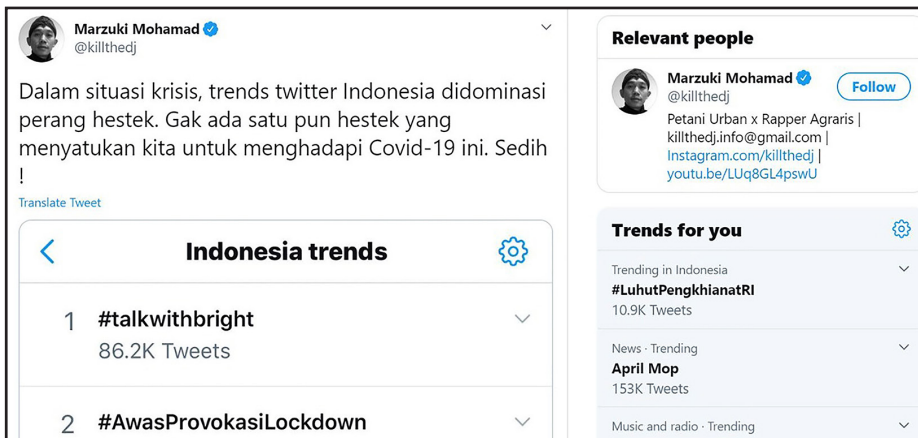
Figure 1: Marzuki Muhammad's tweet on Twitter trending topics

Information dissemination in the media, specifically the internet, which is one of the primary sources for information sought by the public related to the COVID-19 outbreak, has become increasingly relentless. The information presented has been related to accurate and reliable situation reports and false information in various forms, not only text-based but also audio and visual. The chaos of data, coupled with a central response that seemed unprepared, shaped the Indonesian community's perceptions of the COVID-19 outbreak. Even on online social media, there was a sad response from people on Twitter to the current conditions as illustrated in Figure 1: