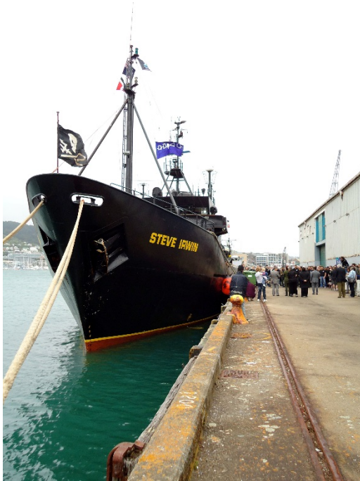
Figure 2. The Steve Irwin