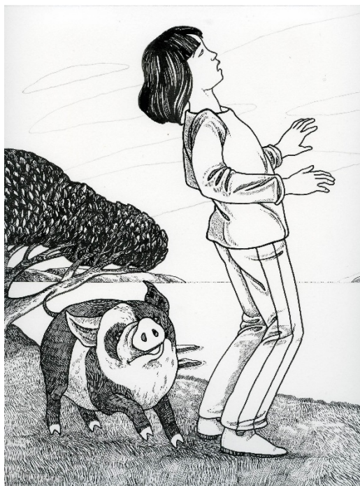
Figure 4. Josie and the Whales: Trance

This developmental stage involved reformatting the graphic narrative, originally devised to conform to the verbal-visual conventions and formal language of comic book design, for mobile screen reading and tablet mediation. 3