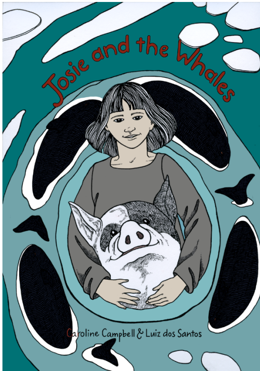
Figure 1. Josie and the Whales: Cover

Norwegian literary professor Anne Mangen notes that reading is a “multi-sensory activity, entailing perceptual, cognitive and motor interactions with whatever is being read. With digital technology, reading manifests itself as being extensively multi-sensory – both in more explicit and more complex ways than ever before” (Mangen, 2008, p. 404). Mangen’s critical assessment of the sensory connectedness associated with the act of reading, and the materiality and technology of the artefact being read, primarily concerns the digital mediation of literary texts. It is, nevertheless, one of the many strands shaping my current practice-led inquiry into graphic narrative and mobile storytelling for young adult readers. 1 As a commissioned illustrator for children’s educational publication, and researcher into print culture, I have long