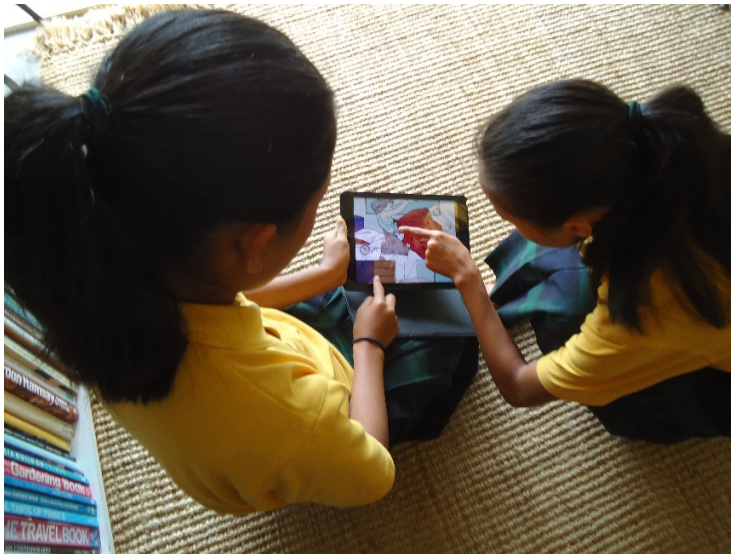
Figure 6. Brooking twins reading

In addition to its operational function, the touch button was created to perform a specific structural role in assisting reader understanding and cognitive perception of the narrative topic. Designed to feature Mr Trundle, Josie's familiar and agent of stabilisation, it visually prompts readers to travel with their eyes and hands across the surface plane of each image and, through a tap of their