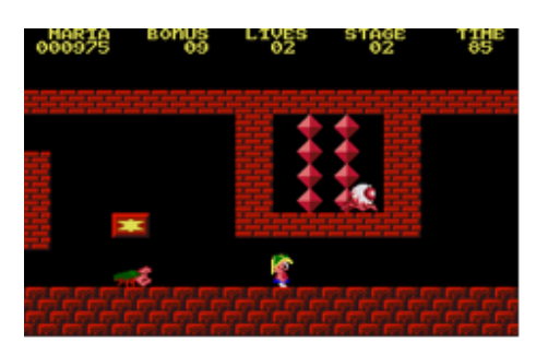
Figure 4. Great Giana Sisters: Releasing the monster and trying to collect the diamonds for a high score?<sup>3</sup>

Why is Reward for Risk such a useful pattern to implement in action games? Because it creates a psychological hook for the player. The human brain is wired so that if we successfully complete something risky, we get rewarded with a short burst of positive endorphins, along with an immense feeling of relief and satisfaction. Very quickly, the player gets addicted to this short emotional high, and is willing to invest significant time in a game to experience it. While this pattern is characteristic of the gambling genre, it is also an essential pattern for action games as it keeps the player engaged with the game. Examples of the Reward for Risk pattern include having to risk your life against a difficult boss to beat a level, being able to cross a dangerous lava pit with the potential reward of an extra life, and fighting more challenging monsters to get better loot. The risk is something that has to be balanced carefully if the reward is critical to the main gameplay; if a game is too hard to complete then players will quit. If a game is too easy then players will get bored. However, if the reward is something that the player does not necessarily need to finish the game (as in Figure 4), then the risk can be as high as the game's designer chooses.