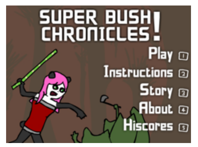
Figure 7. Super Bush! Title screen

In addition to enemies, traps can be dangerous to players. They can be easy to see or hidden. There are many different types of traps. Most traps are part of the level and cannot be defeated or destroyed, simply avoided. Traps are incorporated in games to add a sense of discovery. Players will then carefully observe every detail of the level design. Traps should be visible (as in Rick Dangerous, Figure 6), and not only be found by trial-and-error (as in Lost Vikings). Traps can also be dangerous for enemies, therefore enabling the player to use them to his advantage, adding a twist to the game beyond shooting at everything that moves. There should be a reason for the trap, and a payoff for defeating it, such as a bonus.