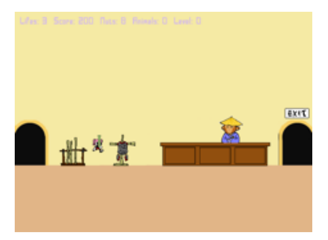
Figure 10. Weapon and armour shop between levels