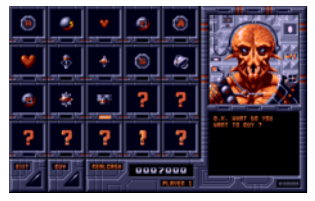
Figure 5. The shop in Xenon 2<sup>4</sup>

In a game with many different enemies and/or levels, it might be interesting to offer the player the possibility to choose his own weapons. Players can then buy and sell weapons and other equipment, and if the prices vary between shops, they can even trade with them. Shops might vary in offer and price. Shops can be located anywhere in a level, but most commonly between levels or at the halfway point. Most shops in games of this type contain a very basic interface. There is usually an easy-tonavigate scrollable item menu - either filling the screen, or over a graphic depicting a shop counter. Sometimes, however, a shop will only appear as an options screen or dialog box after a particular action has been completed, asking whether or not you want to buy or upgrade something. Upgrades to weapons, armour or vehicles are usually available, and better enhancements cost more. Other items that can often be bought from shops include ammunition, damage boosters, and health items. Items from the shop are usually paid for with items collected in levels, or using an in-game currency that collectables or score can be exchanged for. Therefore, a Shop is incorporated into the game to add an element of strategy to the action game, and give the player control over his abilities and equipment. Offers and price can be varied between shops to enable trade and are usually placed at the end of levels or at the half-way point.