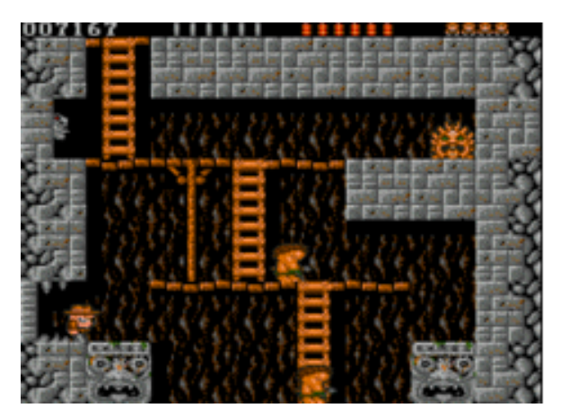
Figure 6. A very cleverly placed trap, left on the upper level in xrick , a clone of Rick Dangerous^{5}