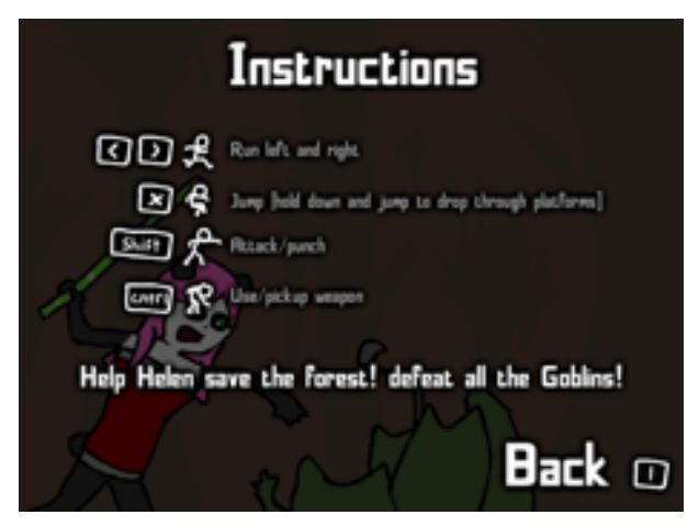
Figure 8. Super Bush! Controls screen