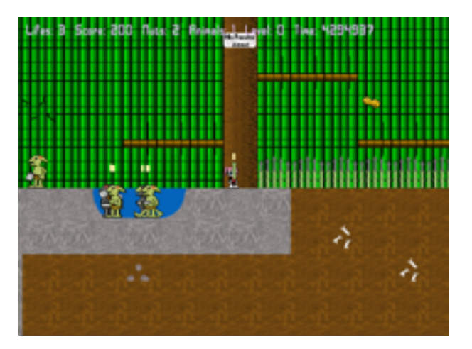
Figure 9. In-game screen shot

A panda bear is defending its jungle against fierce goblins who want to build a town at this location to support their gambling needs. The game includes a number of patterns from the devised pattern language: Something To Do For The Player, Action Consequences, Objectives, Reward In-Game for Risk (score, goodies), Character (panda bear), Morality (helping a good cause, defending the forest, liberating caged jungle animals), Special Abilities (jumping very high and bamboo stick kendo, eat weapon upgrades (bamboo stick) to boost health), Opposing Force(goblins with axes, chainsaws or guns, boss goblins in construction vehicles, i.e. bulldozers), Limited Lives (three), Health Bar (for player and goblins), Manage Character, Items To Collect (nuts as currency), Shop (buy armour and weapon upgrades for previously collected nuts), Competition Between Players (through saved highscores), Game Gets Harder (increasing number of enemies and traps), Trap, A Setting For The Game (conflict over jungle resources) and Level Themes (five levels with slightly different themes).