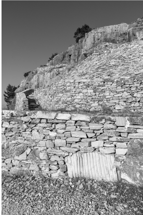
Fig. 3 Golanda and Kouzoupi (1997). Aloula, Mount Pentelicon. Sculpted Faces, New Walls and Staircases.