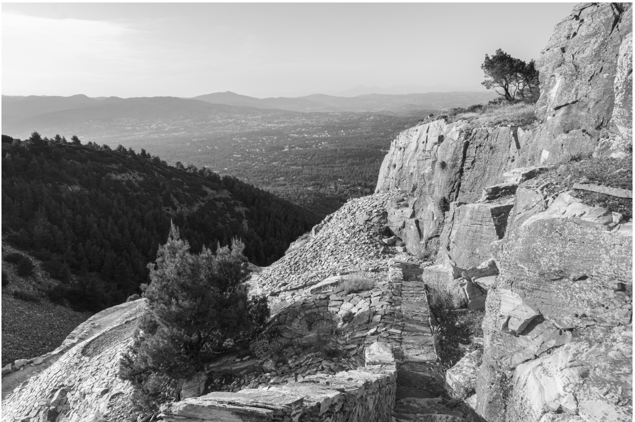
Fig. 4 Golanda and Kouzoupi (1997). Aloula, Mount Pentelicon. The “Inverted Turtle”.