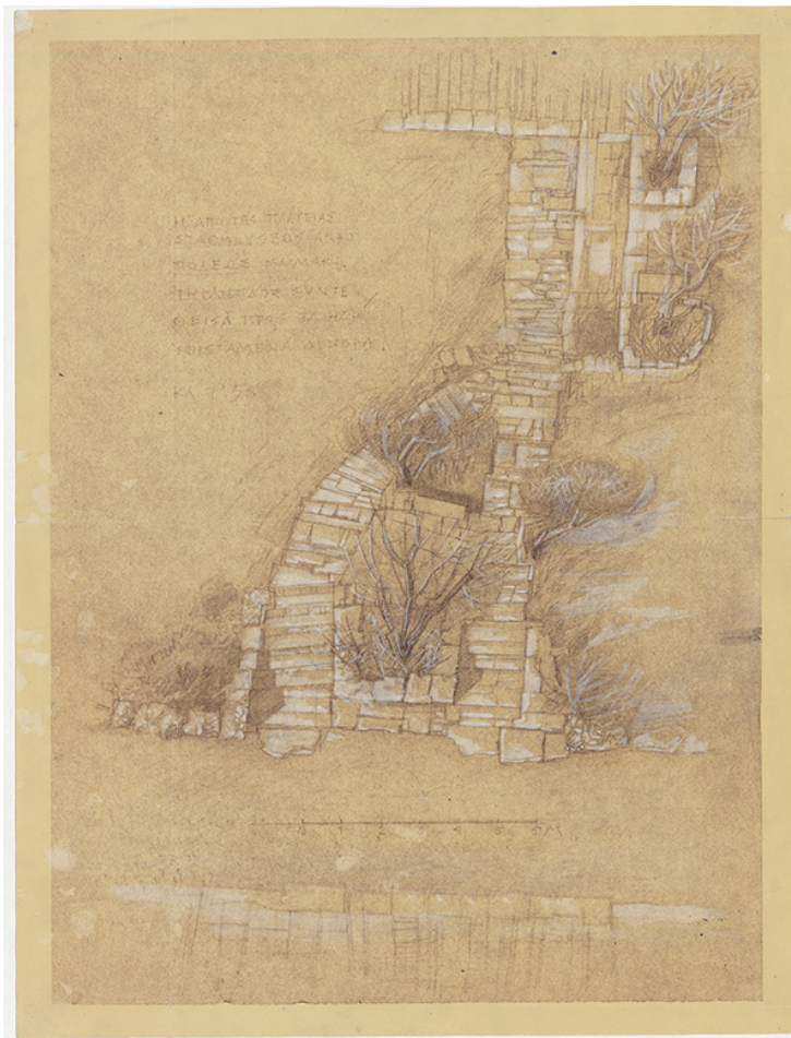
Fig. 7 Dimitris Pikionis (1954-57). Plan of a stepped ascent to the Acropolis. [© 2021 by Benaki Museum Athens]

In Pikionis’ landscaping of the area surrounding the Acropolis, the material used in the paving comes directly from the marble sinks, steps, etc., stripped from the Athenian Neoclassical houses demolished and replaced during the rapid urbanisation of Athens in the 1950s. As Dimitris Antonakakis (1989: 15) notes, these remnants form “an open dialogue with the monuments, the landscape and time.” We contend that this dialogue extends to encompass the specific spaces of Aloula in which some of the stone, from which these artefacts were made, most likely originated. Together, the slopes of Aloula and the surfaces of the Acropolis form a more recognisable version of what Jane Hutton describes as a “reciprocal landscape” of material and labour, in the sense that practices in one site entail a simultaneous and proportionate alteration in the other. As Hutton declares, “circulating back and forth between the two sites, it becomes difficult to see either in isolation” (2019: 3). Aloula therefore serves as a reminder of the significance and recurrence of material through time in the making of Athens.