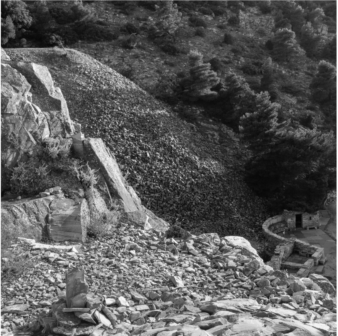
Fig. 2 Golanda and Kouzoupi (1997). Aloula, Mount Pentelicon. Scree Slopes and Stone "Turtles".