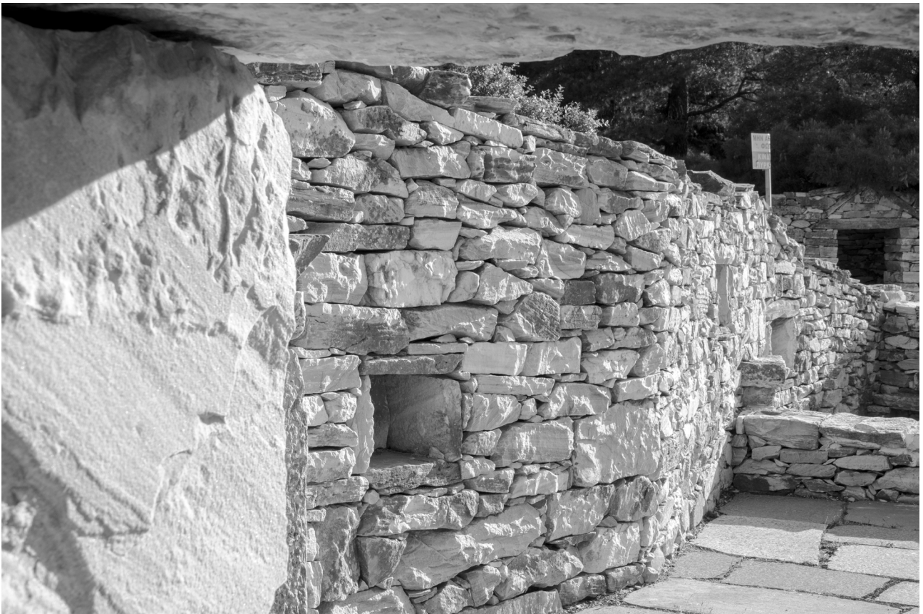
Fig. 1 Nella Golanda and Aspasia Kouzoupi (1997). Open Air Museum of Quarry Arts, Aloula, Mount Pentelicon. Restored Houses for Seasonal Workers.