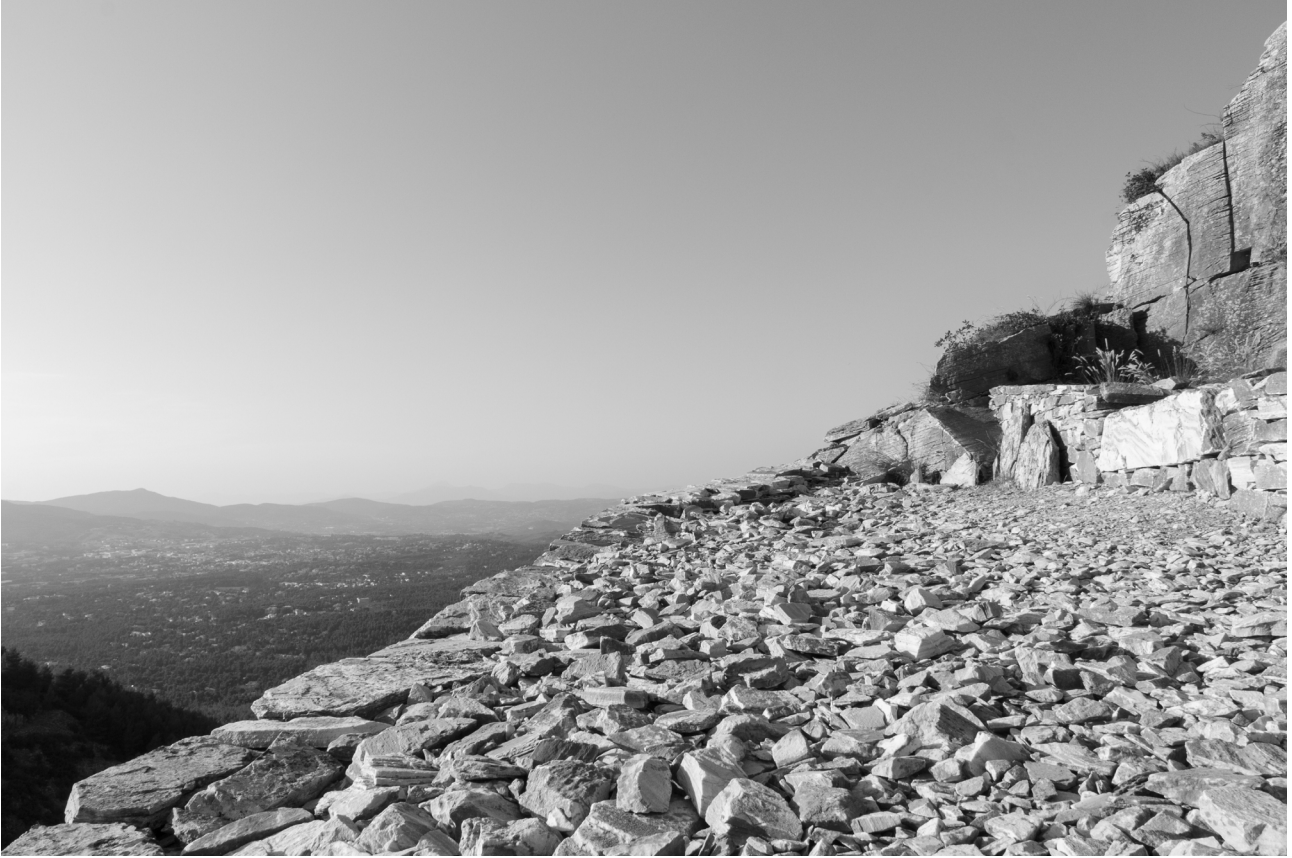
Fig. 9 Golanda and Kouzoupi (1997). Aloula, Mount Pentelicon. View from the Open Air Museum in Aloula, Mount Pentelicon to Marathon.

does not necessitate the formulation of a particular form for material, rather it describes the agency of material in its different stages of being. The landscape of Aloula as a site of repair is a site of ongoing engagement with matter in time. Aloula allows us to conceive new means to engage with and describe landscape which resist the desire to fix.