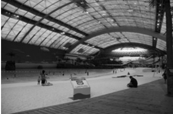
Miyazaki Ocean Dome (SeaGaia), Japan, interior and exterior (2007).