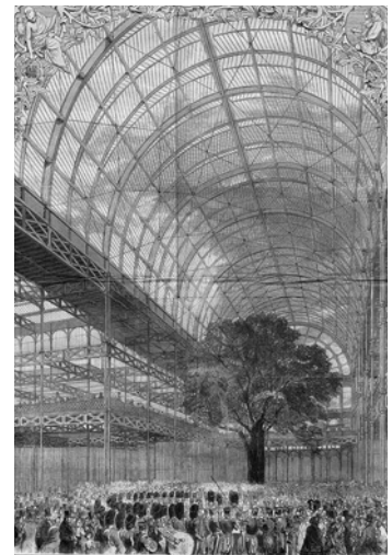
The Last Promenade at the Crystal Palace, from Illustrated London News (1852)

Thus, despite Sloterdijk’s lucid articulation of Western modes of inclusion and exclusion, the dramatic, original difference between inside and outside he posits (1998: 84) plays out in his own work as specific divisions between “with-us and