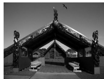
Waha roa at Orakei Marae, Auckland (2003).