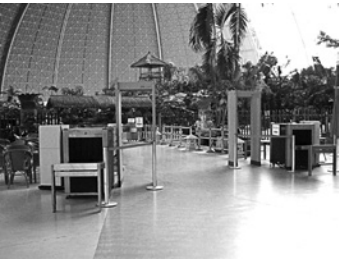
Entrance to Tropical Islands Resort, Brandt, Germany (2006).

masses” (Gunning 2003: 106). Over time, this concept of interiority became central to Western self-understanding. Today, it is hard to unsettle and colours completely our notions of inside and outside, occluding a diversity of spatial relationships.