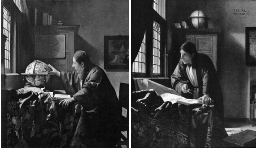
Johannes Vermeer The Astronomer (1668) and The Geographer (1668-9).

gratitude” of others who welcome us, nourish us, give us “an abode and refuge”. As they say, we are “born of someone, [and...] someone receives us” (2009: 6).