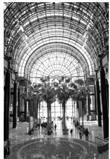
World Financial Center Winter Garden (2007).