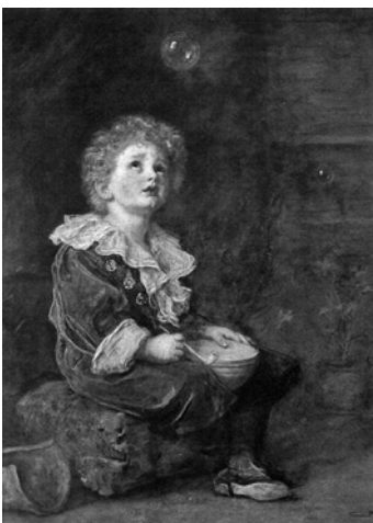
Sir John Everett Millais, Bubbles (1886).

By considering Sloterdijk's project in the context of Aotearoa, I hope to compose a more nuanced understanding of colonial and indigenous spatiality. To these ends the paper falls into three parts: the first provides an overview of a selection of Sloterdijk's thoughts on interior and exterior realms; the second considers specific Māori and Pasifika spatial notions and practices; and the third will pursue a synthesis of these divergent approaches resulting in what I propose to call interpretation of the 'in' .