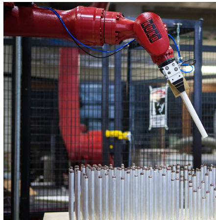
Fig. 4 “Pixel Table” and robotic arm

geometry determined in the design model using a robotic arm. Analyses in the digital model identify where the design curvature exceeds the minimum radius that the pixels can form and the design model adjusted accordingly. Each panel is vacuum-formed on the Pixel Table then trimmed using a water-jet cutter. The butt-joints between panels will be taped and set then finished with heat sensitive dichroic paint.