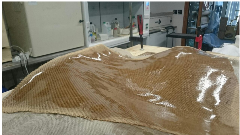
Fig. 5 Biocomposite prototypes

Questions of “why surface?” are well documented in the writing of Avrum Stroll. In his essay Reflections on Surfaces (1992), he refers to J.J. Gibson’s ideas of perception through surface: