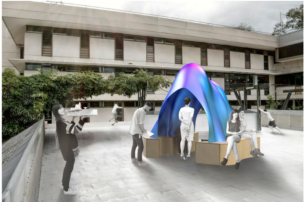
Fig. 6 Wethering Station (2018) [Design: John de Manincor.]

“one’s alibi may be false, a mere pretext to get away with the crime” (Ponce de Leon & Tehrani, 2002: 22). It is acknowledged that the selection of the metaphors derived from the aforementioned Pancho Guedes mural outlined by m3architecture is a somewhat arbitrary means to generate “action”. It is simply a starting point, the alibi to generate and test conceptual ideas concerning surfaces, and in turn, to develop new modes of fabrication.