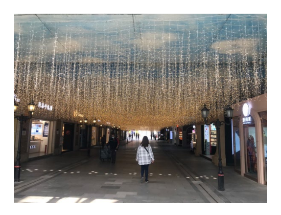
Image 4. A shopping centre in Wuhan on April 8, 2020 (the day Wuhan reopened)