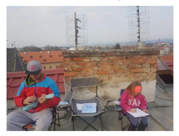
Figure 4. M draws, L plays the ukulele.

Action sports lovers locked down due to COVID - 19 59