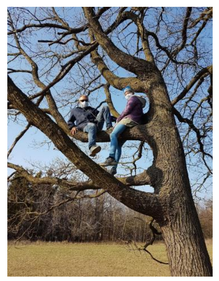
Figure 5. "There is only one certainty, namely the wisdom of uncertainty." (Kundera, 1986, Immortality)

"To possess as the only certainty the wisdom of uncertainty requires great strength" (Kundera, 1986, 21) (Image 5).