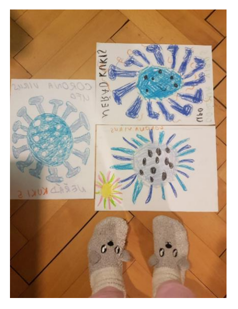
Figure 1. The coronavirus picture.