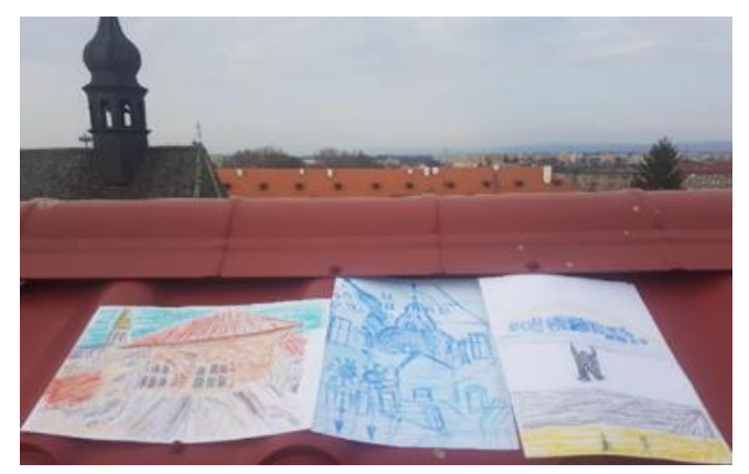
Figure 3. We will go to the roof!