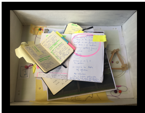
Figure 2. The Sensory Relationship Map is Layered with Poetry, to Reveal what Ordinarily is not Visible, and Generates an Ethnographic Place. (Image: Copyright of the author).

As the weaver of all of these narratives that bump up against one another and other times, as pieces of the puzzle that fall into place to reveal a picture that wasn't revealed before – I invite you to let these stories, primarily women's stories, touch you and to see how they are interwoven with the official reports, public documents and press articles to form a more holistic or gestalt approach, to begin to retrieve what was not only silenced but also fragmented and denied.