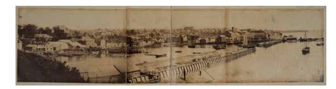
Figure 3, John Nicol Crombie. Commercial Bay from Point Britomart. Albumen silver print in album, 1859. Print size 137 mm x 564 mm. PH-ALB-88p40-41, Auckland War Memorial Museum - Tāmaki Paenga Hira.

Hamel took two scenes from Point Britomart looking across to Commercial Bay. This area would later be reclaimed and the point itself