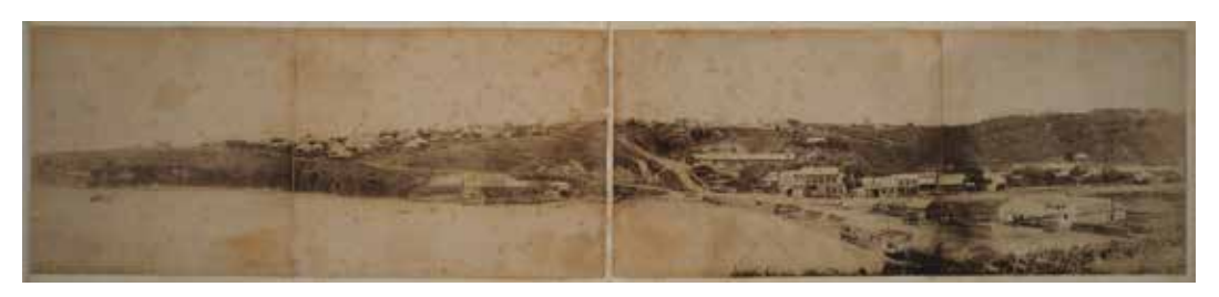
Figure 2, Hartley Webster. Mechanics Bay and Parnell. from Constitution Hill. Salt print in album, 1858. Print size 153 mm x 719 mm. PH-ALB-88p36-37, Auckland War Memorial Museum - Tāmaki Paenga Hira.

Unsurprisingly, few of these works survive in New Zealand as most were indeed likely sent back to the United Kingdom. Hartley Webster's feature mentions Mr Kinder's house and it is in one of the Reverend John Kinder's albums that a photograph matching one of these descriptions can be found today. The two men could have easily been acquainted with one another. Kinder was painting landscapes at this time so it is quite likely that he would have taken an interest in Webster's outdoor work. It is possible that Kinder may have later purchased albumenized paper from Webster's stock for his own photography.<sup>25</sup>