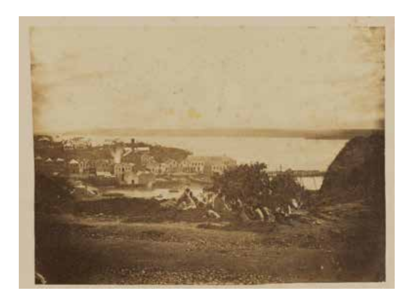
Figure 5, Bruno Hamel. Auckland. Salt print in album. 1859. Print size 112 mm x 259 mm. PHALB-84-p3-1.

The Mechanics Bay ambrotype offers an exciting step further back in time to the introduction of ambrotypes to Auckland. It is hard to imagine that it stands alone in this category of landscape photography, especially as it was easier to produce than a daguerreotype. Perhaps this work was the inspiration for landscape panoramas such as the award-winning panoramic photography that Crombie took to London in 1862. Or perhaps it was merely a test shot for Webster's own panorama of 1858, since it was an easier format to work with being both smaller and faster as it did not require printing. The two photographers could have competed with each other or perhaps even exchanged ideas. The available evidence leans towards Webster as the likely photographer. Further works may yet emerge such as those mentioned in the 1856 Crombie advertisment. Either way, this work represents the local emergence of a style of photography that would dramatically increase in the 1860s as the professional and the amateur alike would take their cameras outdoors. As the only extant ambrotype view of early Auckland this work marks an important step in the development of local photography. Perhaps more examples of early urban landscape photography will emerge in the future taking us back even further to the daguerreotype and calotype period. For the moment, this work is as far back as we can see.