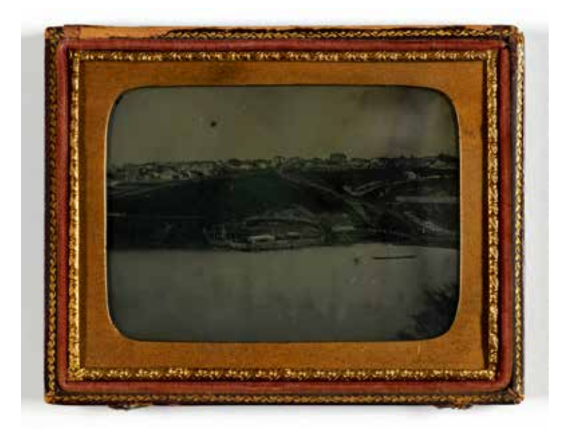
Figure 1, Attributed to Hartley Webster. View of Parnell and Mechanics Bay, Auckland. Quarterplate ambrotype, ca. 1857. Case size 95mm x 122mm. PH-2017-13, Auckland War Memorial Museum -Tāmaki Paenga Hira.

The recently acquired ambrotype features a view of Mechanics Bay seen from the vantage point of Constitution Hill. Parnell buildings are visible on the hill above and a waka can be seen near the shore. In the centre is an enclosed area for shipbuilding.