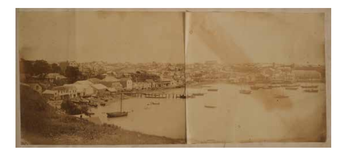
Figure 4, Bruno Hamel. Auckland. Salt print in album. 1859. Print size 116 mm x 159 mm. PH-ALB-84-p2-1, Auckland War Memorial Museum - Tāmaki Paenga Hira.