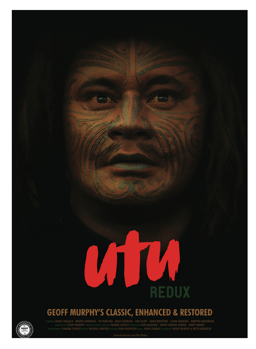
FIGURE 3. Utu Redux poster image courtesy of the Aotearoa New Zealand Film Heritage trust. Utu Redux Poster (2013) P234170. Poster Collection, Ngā Taonga Sound & Vision. Production Company: Kiwi Film Productions Ltd