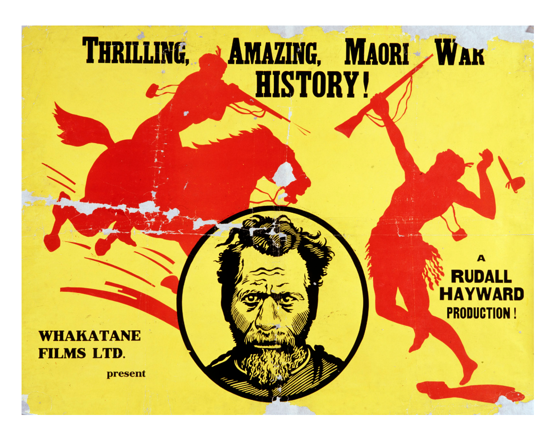
FIGURE 2. Detail from a poster for Rudall Hayward's 1927 film The Te Kooti Trail . The Te Kooti Trail (1927) Po3841. Poster Collection, Ngā Taonga Sound & Vision. Production Company: Whakatane Films.

This adherence to Cowan's work is apparent in The Te