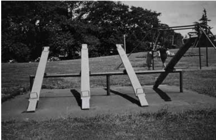
Paul Cullen, black and white photograph of sculptural ideas, 1975.