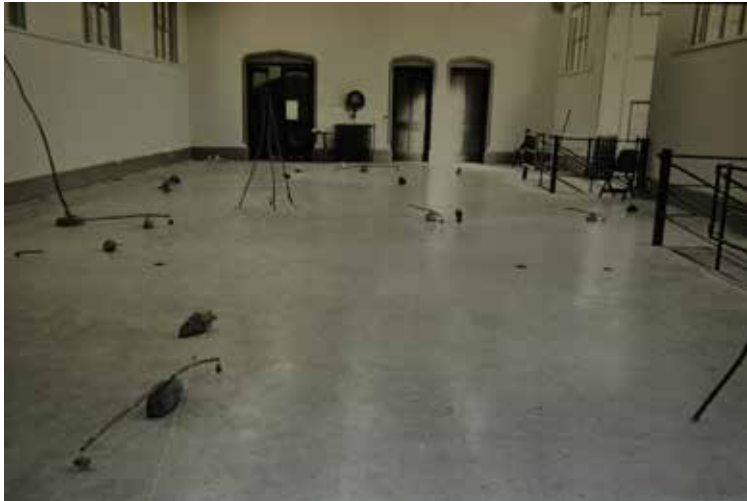
Paul Cullen, Of Possibilities and Probabilities, 1975, Centre Art Gallery, Christchurch. Found sticks, found stones, string, various dimensions. Digital scan from 35mm transparency.

boundary, a fraught undertaking where tensions can arise in the demarcation of built environs.