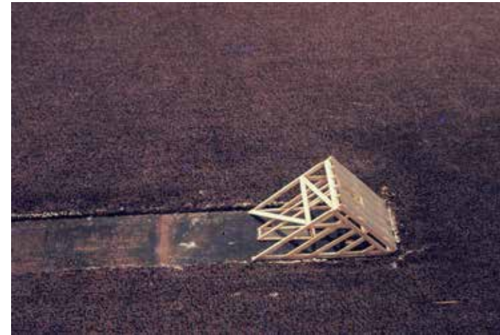
Paul Cullen, Untitled Building Structure (installation view), 1979, balsa wood, various dimensions. Barry Lett Galleries, Auckland, N.Z. Digital scan from 35mm transparency. Foxcircle Archive, Auckland.

In his notes on the exhibition, Wystan Curnow pondered where shafts and tunnels might lead, and he understood how reading the