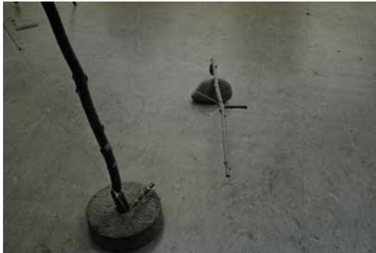
Paul Cullen, Of Possibilities and Probabilities , 1975, Centre Art Gallery, Christchurch. Found sticks, found stones, string, various dimensions. Digital scan from 35mm transparency. Foxcircle Archive, Auckland.

equilibrium, energy' can be understood in a different manner to the formal poetics by which Wilson celebrated Cullen's work. 10