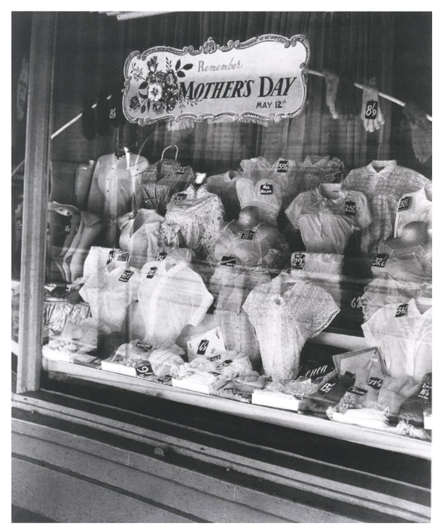
Figure 2. Les Cleveland, "Shop window in Riddiford Street, Newtown, Wellington, October 1957"