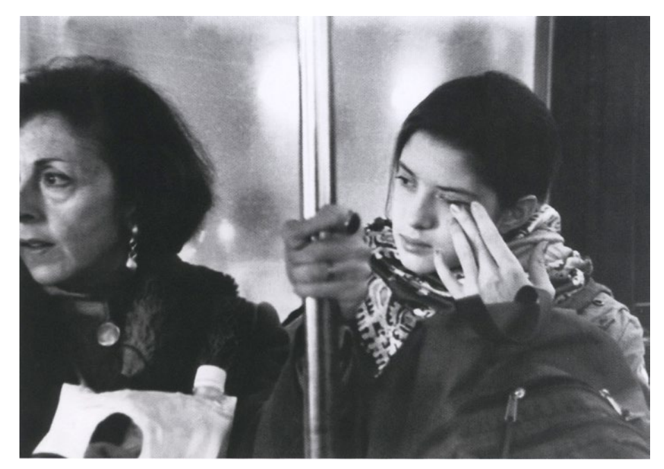
Figure 4. Les Cleveland, "Mother and Daughter, New York 1994". Image from Les Cleveland: Six Decades – Message from the Exterior , published by City Gallery Wellington and Victoria University Press, 1998.