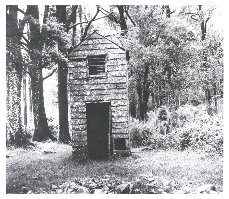
Figure 1. Les Cleveland, "Farmer's killing shed at Haupiri, Westland, 1957".

arts and his intellectual investment in the study of mass media and popular culture, his dissensus within the consensus points in a very different direction to the literary nationalism of the Landfall project.