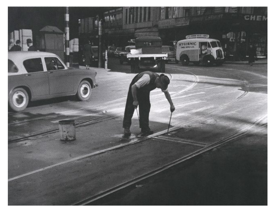
Figure 3. Les Cleveland, "Workman cleaning points in tramlines at corner of Manners and Willis streets, Wellington, 16 September 1957".