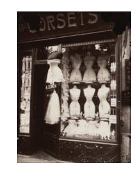
Figure 2a. Eugene Atget, 'Boulevard de Strasbourg', Corsets, Paris, 1912.