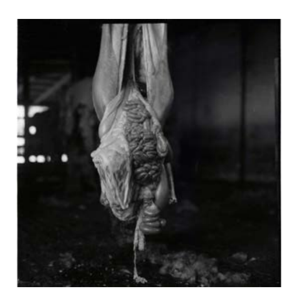
Slaughter, 1985. Gelatin silver print.

My first Peryer experience was with Neenish Tarts, Jam Rolls and Donuts (1983) as an art student visiting The Dunedin Public Art Gallery. The unusual arrangement and grainy texture of these black and white photographs sent messages I did not expect of food photography. What was supposed to look sweet and delicious became a series of formal patterns from afar, but somewhat unsettling close up. These photographs transported me back to my high school job in a dubious café at the local suburban mall, where sub-standard cabinet food was a poor disguise for the last indoor smokers refuge. However, this kind of poetry of form in the mundanity of a food cabinet was the kind of aesthetic Peryer was chasing. The artist's cake images began when his eye was caught by some doughnuts in a bakery in Devonport and he promptly bought three dozen of to take home, arrange and photograph. They evoke the unremarkable eateries in city centres and regional towns across Aotearoa New Zealand— nowhere of particular importance—but somewhere we are all familiar with.