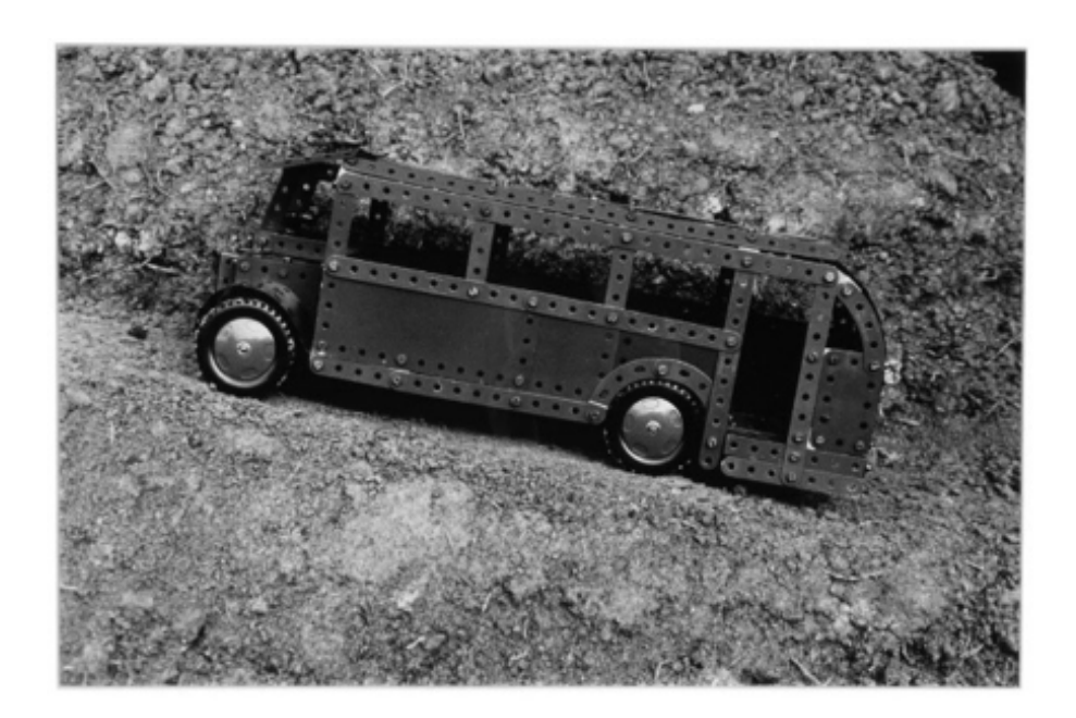
The Meccano Bus, 1994. Gelatin silver print.

While the meat industry is celebrated for forming the economic backbone of our country, Peryer shows us another reality, also seen in other images of animals including Farm Study (1986), Dead Steer (Waikato) (1987), Deer (1993), Goat Head (2008) and the repulsive, flesh coloured Carcass (2010), which was actually a fibreglass prop from a film set.