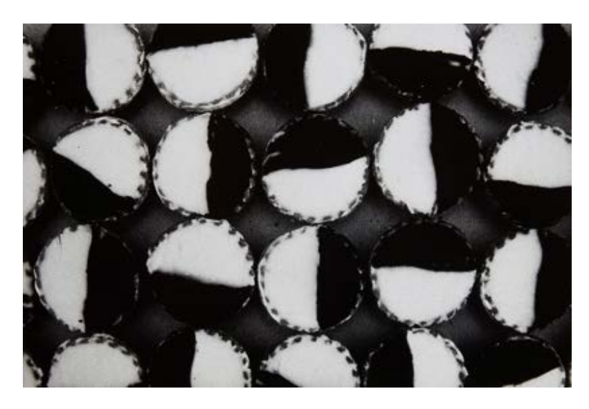
Neenish Tarts, 1983. Gelatin silver print.

While he moved on from portraits fairly early in his career, Erica-Winter reveals a quintessential approach to image making that has remained with Peryer throughout his practice. Constructing and titling his images like clues in a mystery for us to solve, Peryer gives his audience scope to discover his subjects at their own pace, and see something of themselves reflected back at them.