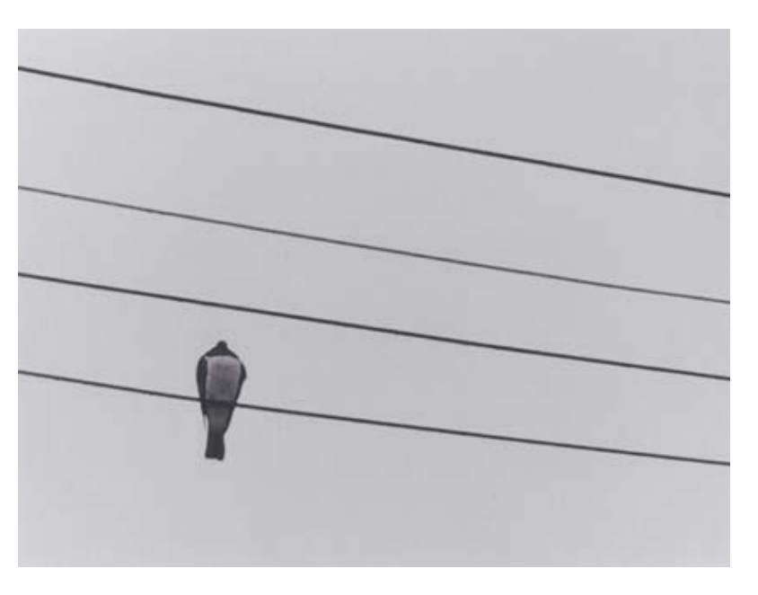
Kereru, 2006. Gelatin silver print.

Blood Lilies (1981) is another photograph that has had less attention in the artist's oeuvre, but one I've come to think of as a stepping stone between his moody photographs of the late 1970s, and what developed into a signature composition: that unmistakable triangle submerged in curves. Again, drawing on the New Zealand experience, this photograph conjures up the feeling of being lost in the bush; trampling through dense undergrowth without a path in the damp—knowing you're surrounded in utter beauty—but also, that you are at risk<sup>5</sup>. Calla Lillies (2012) was taken decades later, yet is composed in the same way. However, in the intervening thirty years between these two images a mellowing had occurred, signalled most clearly in Calla Lilies through the artist's use of vibrant colour, shot spontaneously on his iPhone. The documentary Peter Peryer: Portrait of a photographer also showed a transition in the artist—a softening of character and sense of humour that I had taken for granted as I got to know him in his later years. At one point in the film he mentions how stepping away from the dark, dramatic portraits and scenes that launched his career signalled a maturing in him from "a crucified Christ to a laughing Buddha" and that he had learnt it was in fact quite easy to take a depressing image. This led him on a path in search of visual harmony.