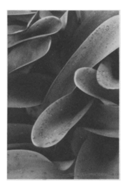
Blood Lilies, 1981. Gelatin silver print.

What is real and alive, and what appears to be so but is manufactured, was a constant theme in Peryer's work and reflected the artist's interest in the deceptive nature of his medium. This was an approach he often used in photographs of aeroplanes, trains and road vehicles. The Meccano Bus (1994) is one such example, which took around eighteen months to create. It involved Peryer sourcing a model from his childhood similar to the bus he travelled to school on convincing its collector to lend and assemble it for him, and then locating a decent allotment of clay to photograph the bus on.