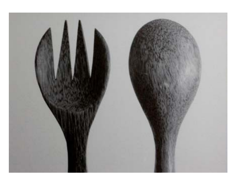
Fork and Spoon, 2003. Digital print.

"...carefully selected and isolated distillations of reality through the filters of subjectivity, a sort of creative shorthand for the relationship between the individual and the world. Importantly both also leave plenty of space for the viewer/ reader to insert themselves in a dynamic and involving response."