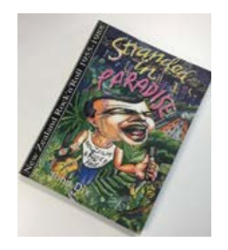
Stranded in Paradise, 1988