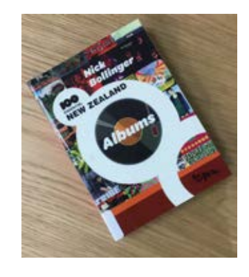
100 Essential New Zealand Albums, 2009