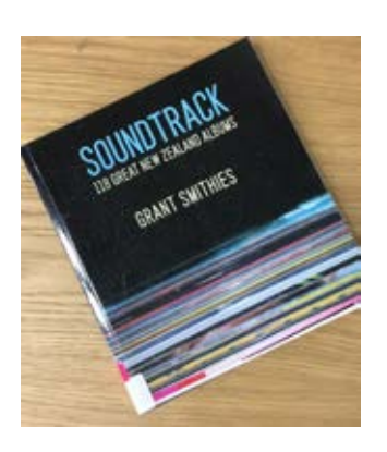
Soundtrack: 118 Great New Zealand Albums, 2007

of this goodwill would have been nothing without the songs" and pays particular attention to successful artists who were 'groomed' carefully by both government agencies and record companies working in close partnership. 28 Ultimately, NZ Rock 1987-2007 is, like its predecessors mentioned here, celebratory and largely uncritical. It is however a fascinating documentation of a quite remarkable period of growth, success and development in New Zealand popular culture that shows that deliberate, carefully planned and orchestrated government intervention can make a significant difference to a cultural sector.