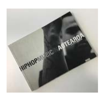
Hip Hop Music in Aoteroa, 2004

During this period, Gareth Shute produced two comprehensive studies of music in New Zealand, one genre specific, Hip Hop Music in Aotearoa (2004), and a broader work NZ Rock 1987-2007 (2008).