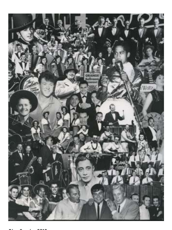
Blue Smoke, 2010