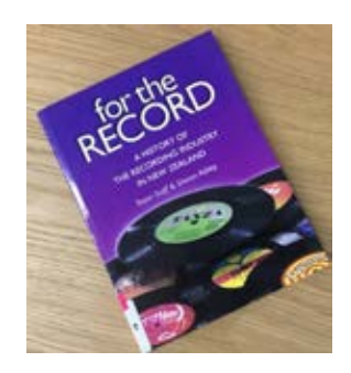
For the Record, 2002