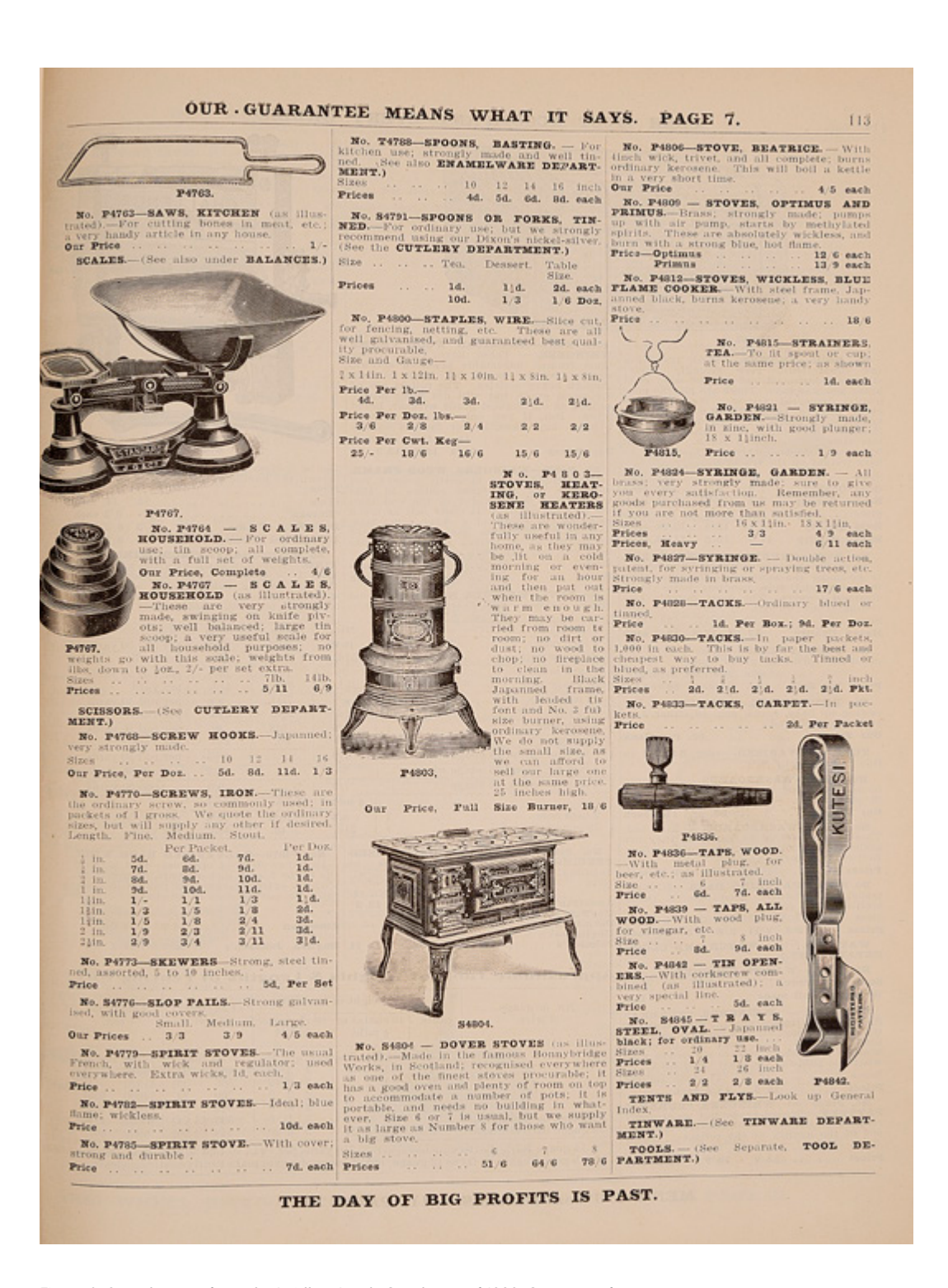
Figure 2. Sample page from the Laidlaw Leeds Catalogue of 1909.