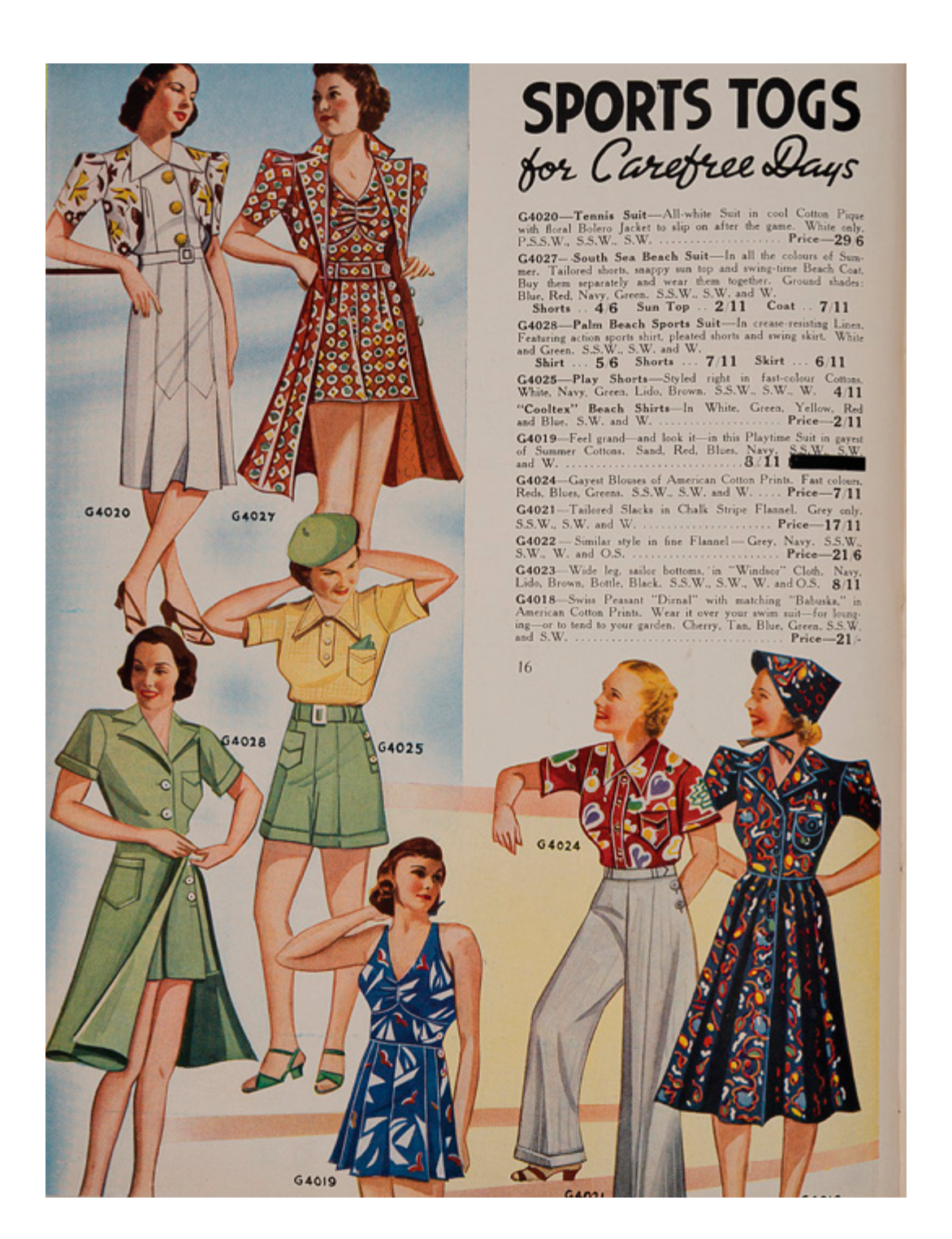
Figure 7. Advertisements for sportswear from the 1938 Catalogue, p.218.

Another aspect of the changing expectations of women over the period of the catalogues is the increasing 'professionalisation' of housework. The role of 'household germs' in common illnesses, particularly threatening the health of children, was widely known by 1920<sup>29</sup> and in 1932 New Zealand acquired an affordable women's magazine, The New Zealand Woman's Weekly <sup>30</sup>, which focused on domestic matters such as hygiene, and included advertising which encouraged spending on cleaning products and household goods. For the middle class home, which had previously been used to at least one servant to do the 'heavy work' like laundry, servants had become rare, so it was now the role of the women of even middle class households to perform housework of all kinds. Classes for girls