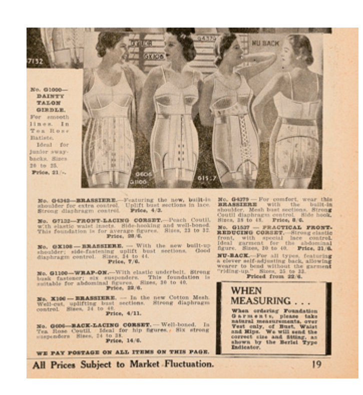
Figure 6. 1938 Catalogue advertisement for corsets.

By the last catalogue, in 1938, the types of corsets had changed, and also perhaps their functions. The drawings are of fuller figure models, and texts such as that for the "G6543 'Corselette'" in "'tea rose batiste'", may feature "a strong underbelt" designed for the "abdominal figure"<sup>22</sup> (see Figure 6). The adult female body still required to be moulded into a shape approaching the ideal for the day, and also, perhaps, to control any public display of fleshy curves underneath. There is less emphasis on the 'bust' and hips, again exemplifying a change in what the fashionable figure was like. By the 30s 'talkies' had arrived, Hollywood films were widely viewed, and popular actresses like Katharine Hepburn and Joan Crawford were slim and willowy, embodying that change.