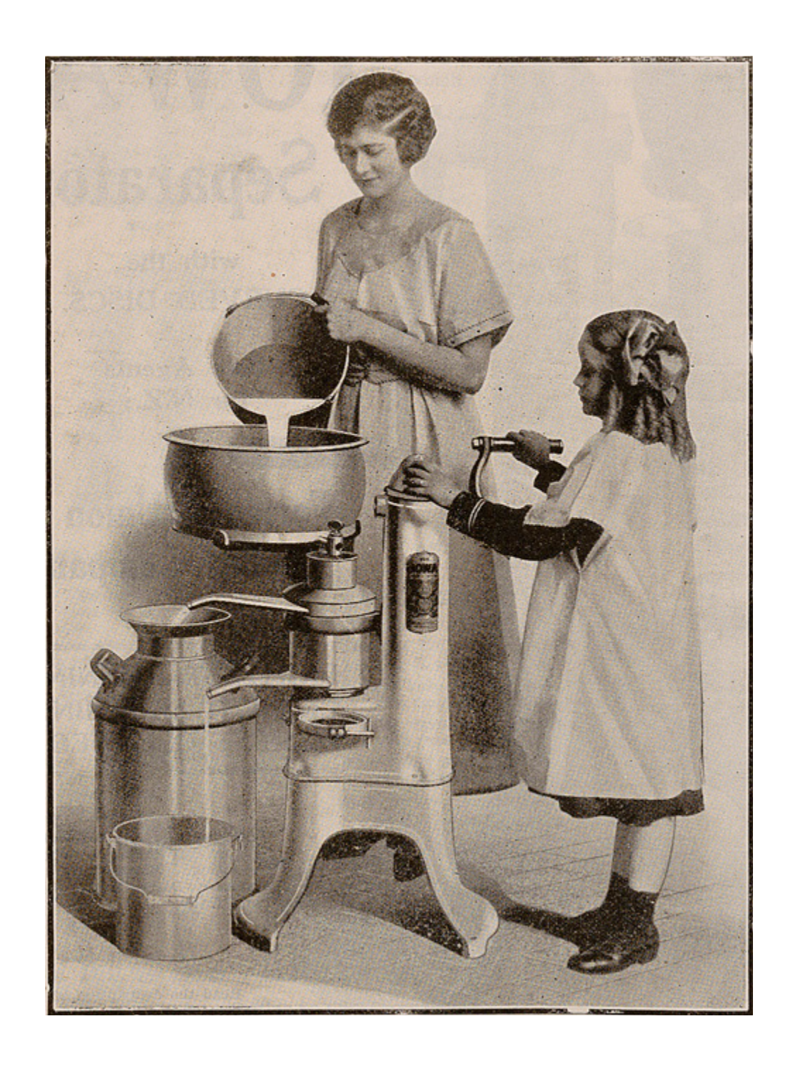
Figure 4. Advertisement for a milk separator, p.164 of the 1921 Catalogue.

Nevertheless, the word 'women' is rarely used; ubiquitous instead is the then more polite term 'ladies', and the main arenas where 'ladies' are depicted and addressed throughout the period are in personal products, particularly women's clothing. 13 Again, vocabulary gives a clue to contemporary characterisations of the women being addressed by the catalogues. In 1909 fabrics are "well and stoutly woven"; "will give even longer wear and better service"; "will make up nicely and wear well" and are "all of British make", or "of best Home make". Even 'tussore silk', a luxury fabric, is "of known quality, and very dependable wear".14 Clothes may be "stylish"15 or "very pretty"16 but references to quality, durability and value for money dominate, and there are few references to fashion at all. Of course, fabrics made in Britain still denote quality - and 'Home' is still the United Kingdom. The vocabulary suggests that in 1909, women customers are responsible for sewing, knitting and selecting hard-wearing clothing, while being frugal, prudent – and patriotic.