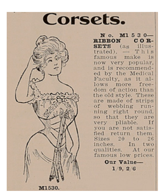
Figure 5. Advertisement for corset, p.50. of the 1909 Catalogue.

Of particular interest for what they depict of changing attitudes to the female body are the corset advertisements throughout all the catalogues. Corsets themselves, of course, are designed to 'control' the body and literally to make it 'conform'. Scholars have discussed the significance of this actual, as well as symbolic, manifestation of the constraints imposed by the narrow range of acceptable body-shapes and also roles for women. <sup>17</sup> Nevertheless, opinion about the tight-lacing of corsets was divided, even at the time. Doctors in the 19th century considered it caused a range of physical problems – most of which have been debunked today – and were aware of its effects on the spine<sup>18</sup>. The 1909 catalogue advertises corsets designed for tight-lacing (see Figure 5). They are described as "unbreakably strengthened", for example, but customers are reassured that they have been also "recommended by the Medical Faculty". <sup>19</sup>